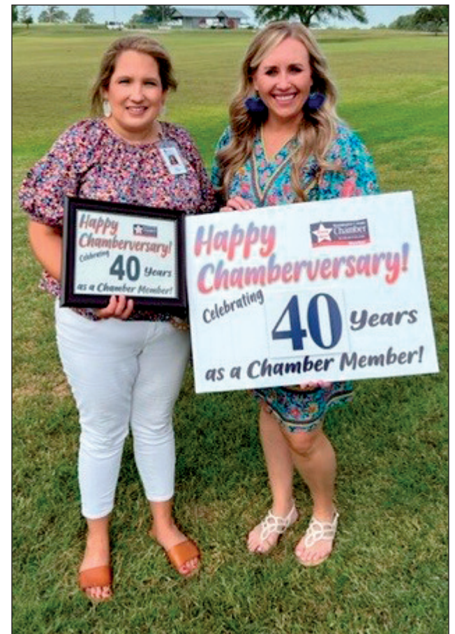
BSSLC 40 years