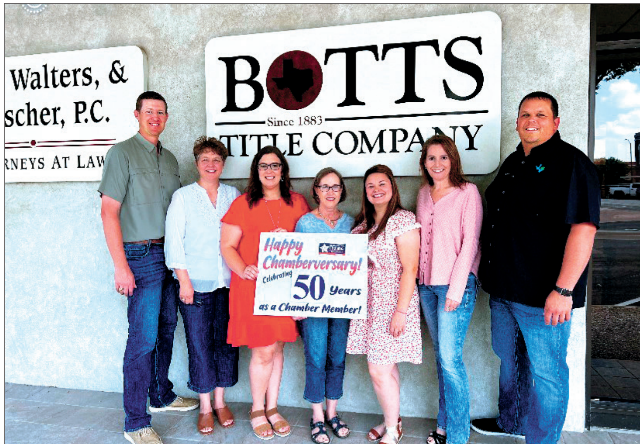
Botts Title Co. 50 years