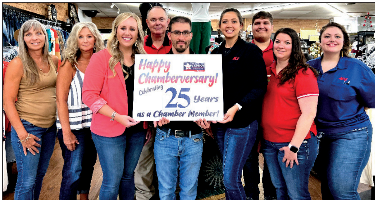
Ace Hardware 25 years