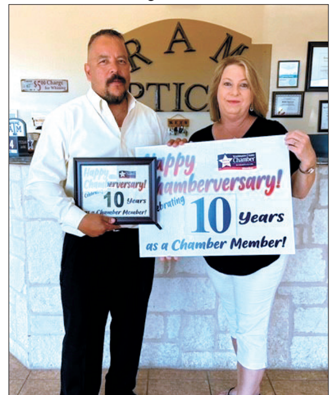
RAM Optical 10 years