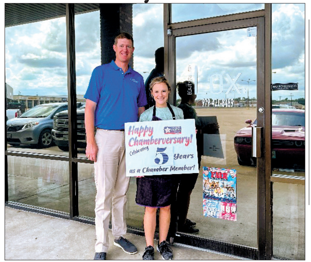
Lox Beauty Gallery 5 years