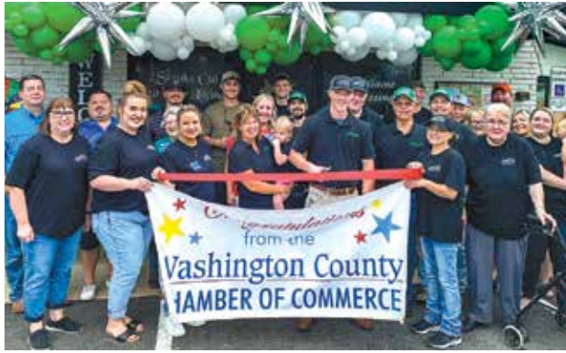
Brenham Quality Meats Located at 509 South Market St.