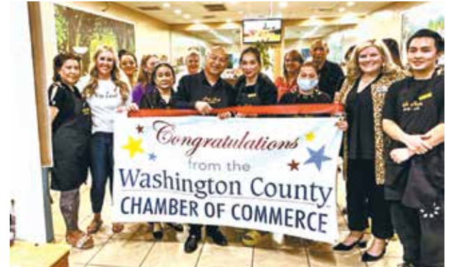
Star Nails Located at 2831 Hwy