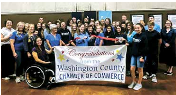
Legacy Christian School Located at 906 W. Stone St. in Brenham