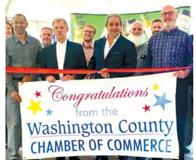
BRIANNAS Fine Salad Dressings 40th Anniversary with a Ribbon Cutting