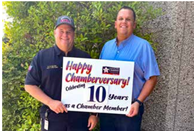
St. Matthew Lutheran Church of Sandy Hill 10 years