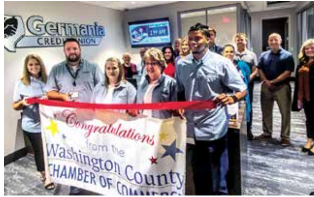
Germania Credit Union Located at 507 Hwy. 290 E