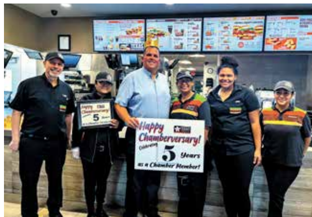
Burger King 5 years