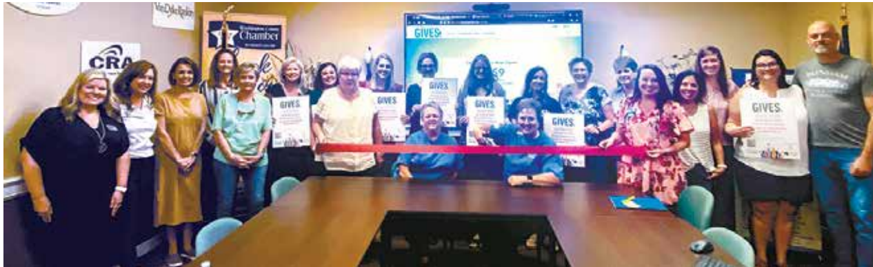
Kick-off of the 4th Annual Brazos Valley Gives campaign Now through October 18th, the Day-of Giving.