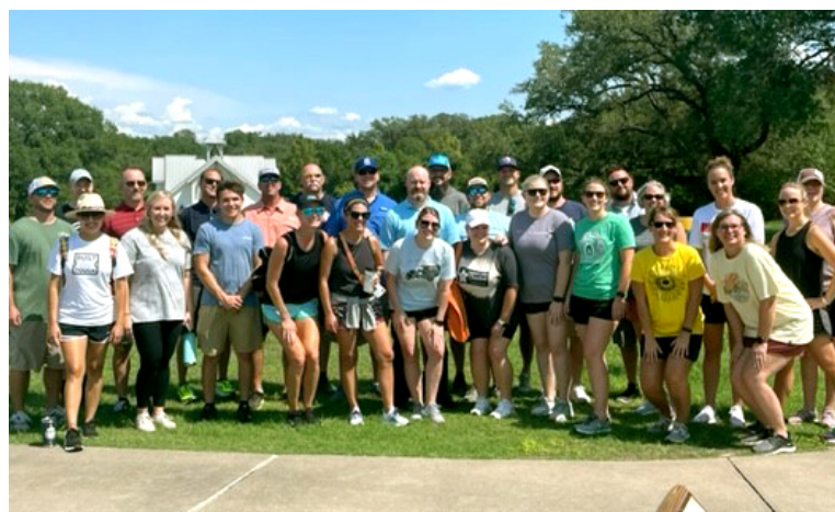
LWC group at the end of the day

The session was full of activities to focus on team-building