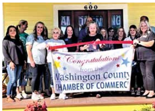
Sunny Day House, LLC. Located at 600 S. Day St. in Brenham