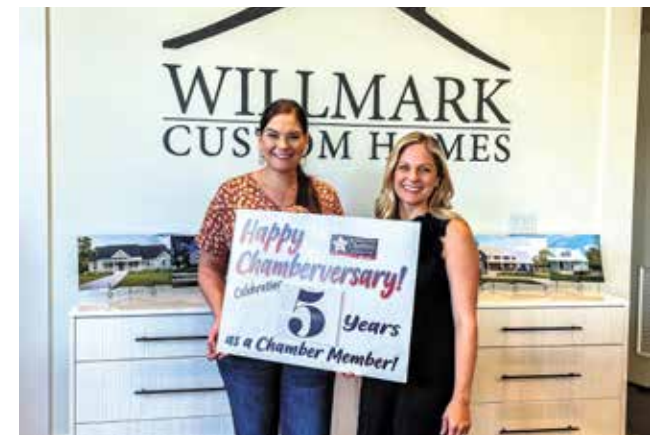
Willmark Homes 5 years