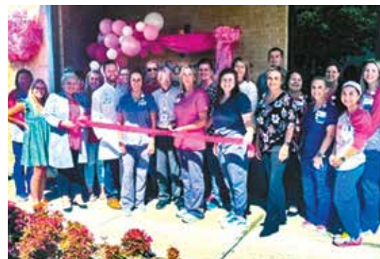
Baylor Scott & White Imaging Center Kick-off of Breast Cancer Awareness Month