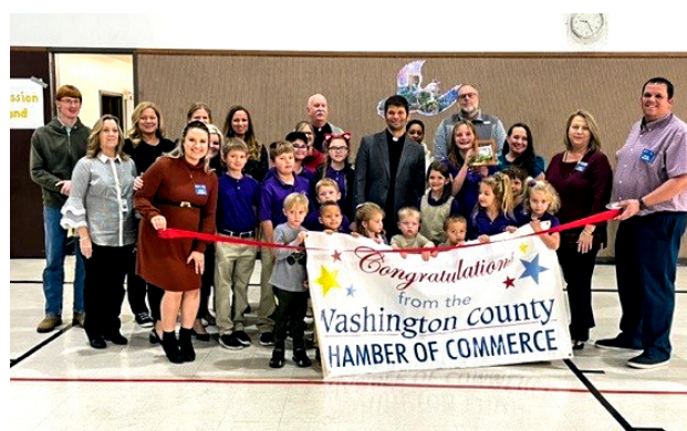
Grace Lutheran School 75th Anniversary 1212 W. Jefferson, Brenham