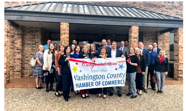
Lone Star Trust & Investment Services 401 S. Austin St., Brenham