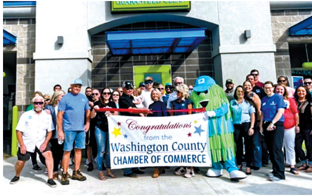
IQ Car Wash 1404 N. Park St. Brenham, TX 77833