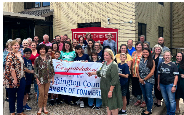
First Baptist Church School 45th Anniversary 302 Pahl St., Brenham