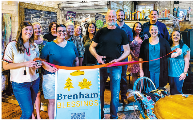
Brenham Blessings PO Box 2155, Brenham, TX