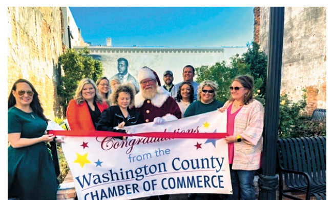
The Storybook Cottage Brenham 214-213-8101