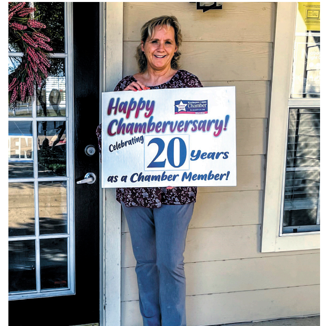
Brenham Oaks 20 years