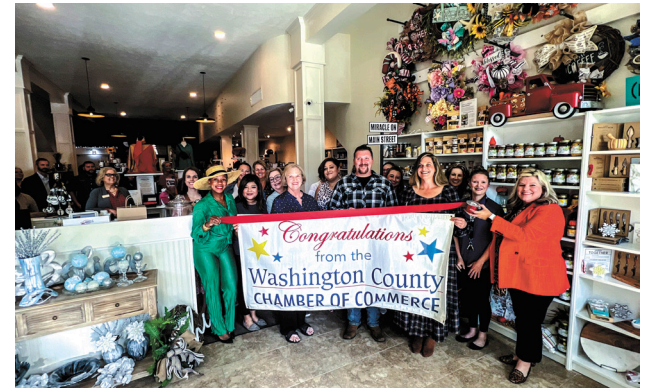
Markets on Main by The CEO 101 E. Main St., Brenham