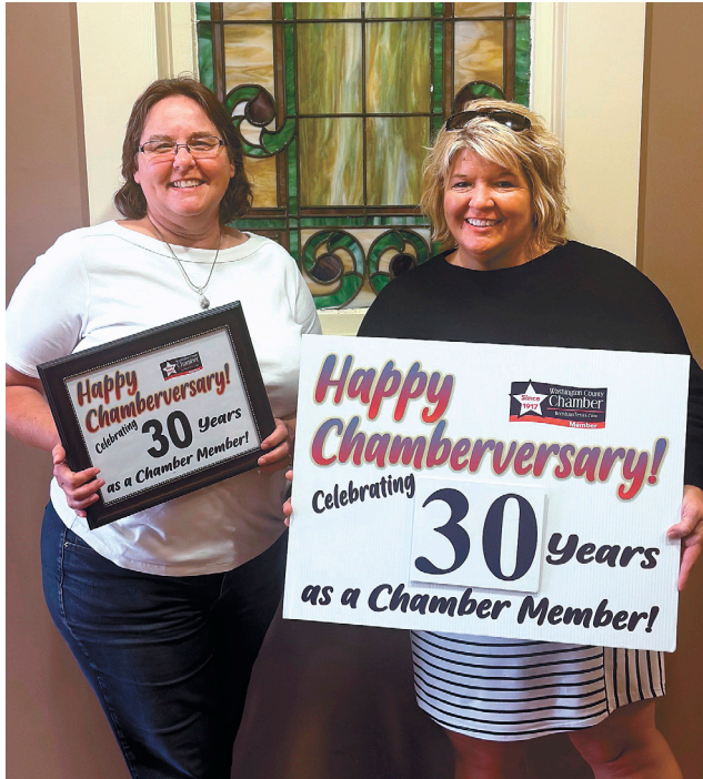
Ant Street Inn 30 years

The Blue Blazers have begun celebrating our member's "Chamberversaries" by surprising them with Celebration Visits and thanking them for their investment.