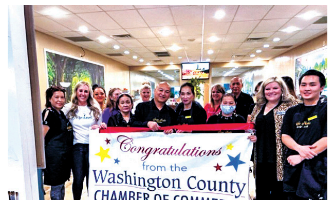
Star Nails 2831 Hwy. 36 S., Brenham