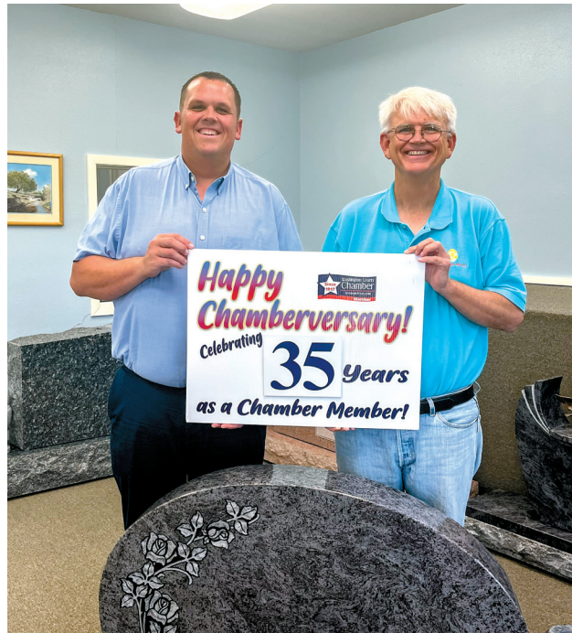
Brenham Monument Company 35 years