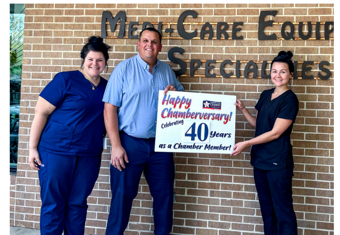
Medi-care Equipment Specialties 40 years

WE PROUDLY SUPPORT BRENHAM ISD AND BURTON ISD