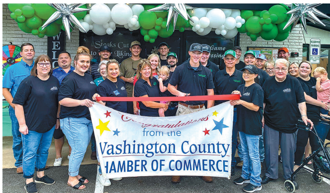
Brenham Quality Meat Market 509 S. Market St., Brenham