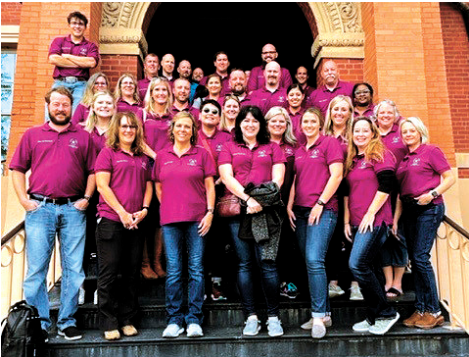
The class on the steps of Old Main on the Blinn Campus.