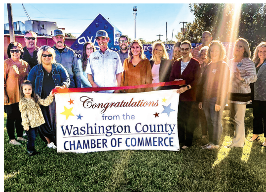
Platinum Bin Washers Brenham, 979-203-4565