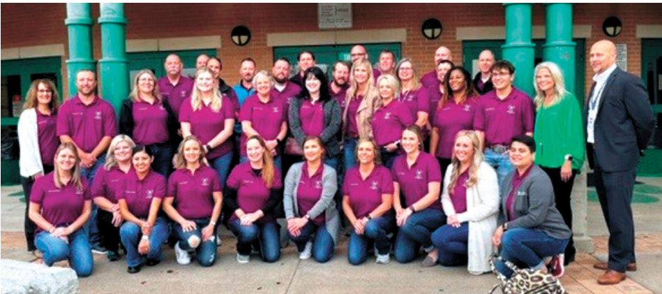
LWC Class at Brenham High School