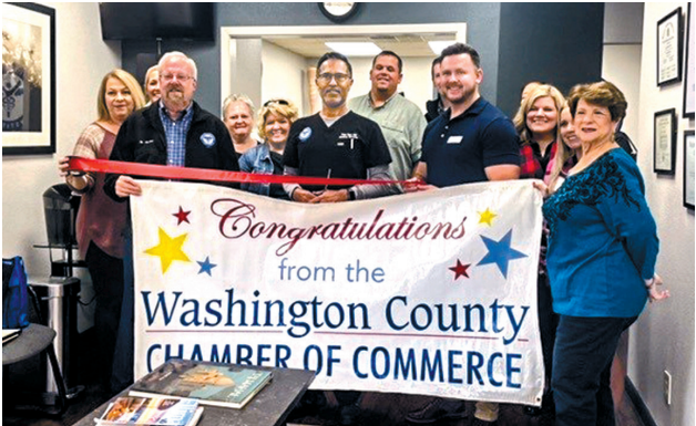
Texas Vein and Wellness Center 635 Medical Parkway. Brenham, TX