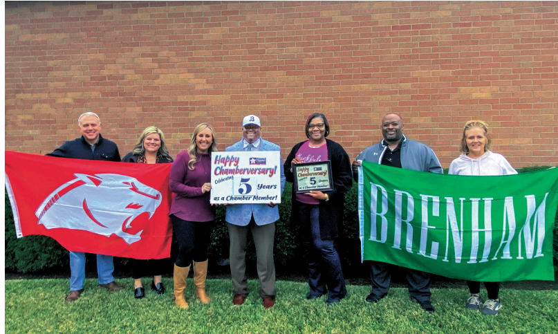
Brenham GameChangers 5 years