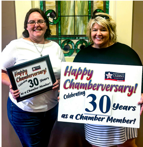
Ant Street Inn 30 years

The Blue Blazers have begun celebrating our member’s “Chamberversaries” by surprising them with Celebration Visits and thanking them for their investment.