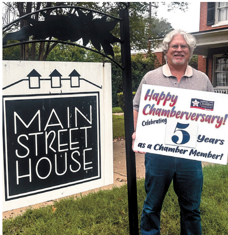
Main Street House – 5 years