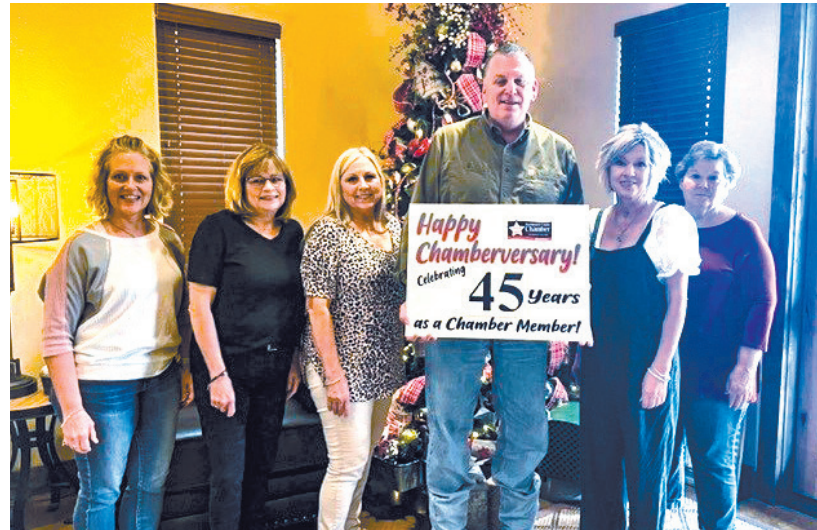
Dahmann & Associates – 45 years