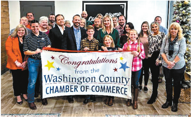
Mercy Creek Homes 301 E. Main Street, Brenham, TX