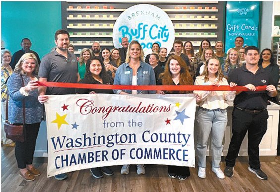
Buff City Soap 960 U.S. Highway 290 East, Brenham, TX