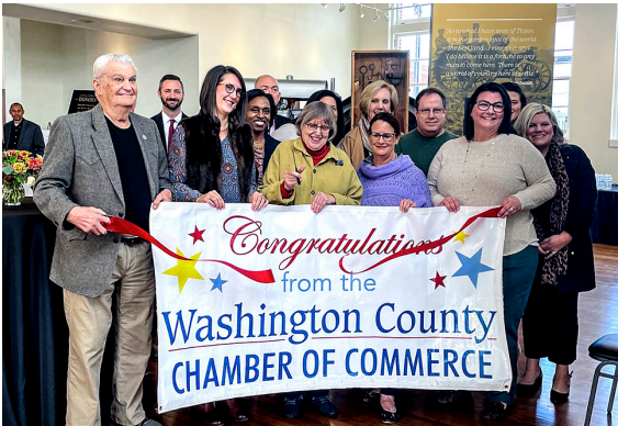
Brenham Heritage Museum 105 S Market St., Brenham, TX