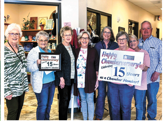
Margaret E. Blizzard Senior Activity Center 15 years