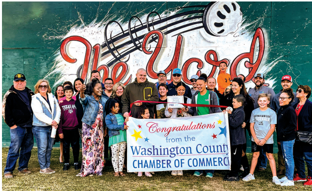
The Yard 1405 W. Main Street, Brenham