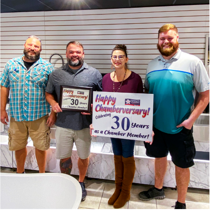
Moore Supply Co./The Bath & Kitchen Showplace 30 years