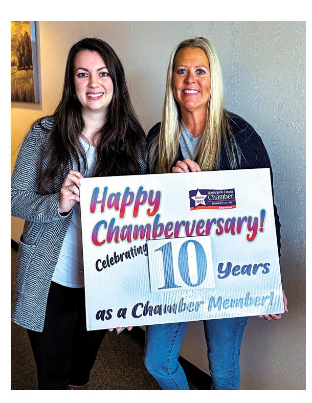
Century 21 and We Manage Properties 10 years