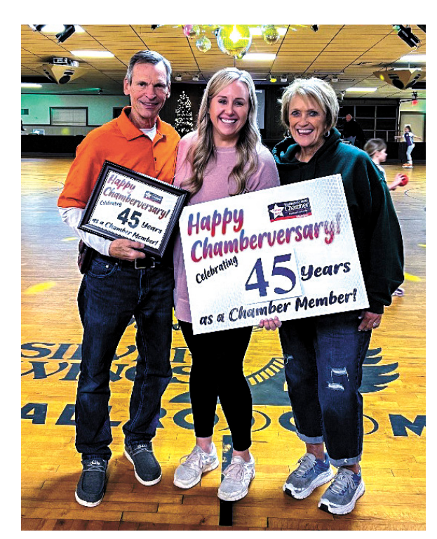
Silver Wings Ballroom 45 years