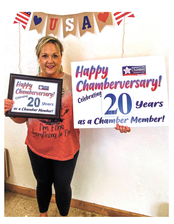
Webb Printing 20 years