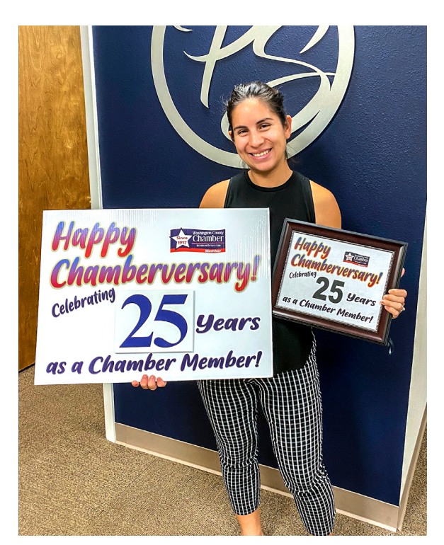
Personnel Services 25 years