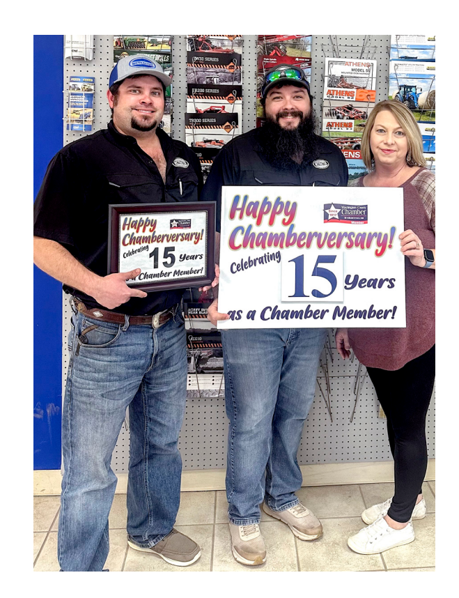
WCT Outdoors 15 years