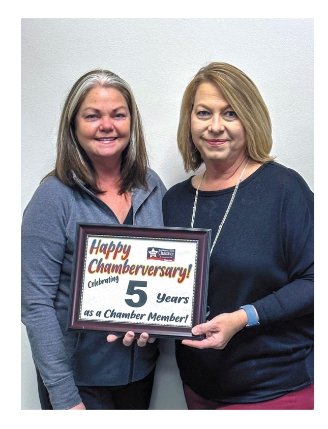
Kmiec Construction 5 years