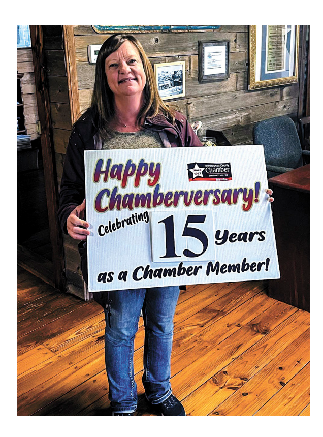
Burton Heritage Society 15 years