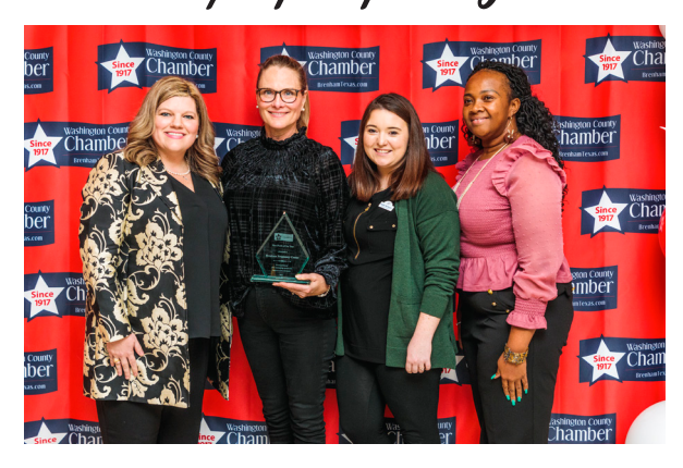
Brenham Pregnancy Center