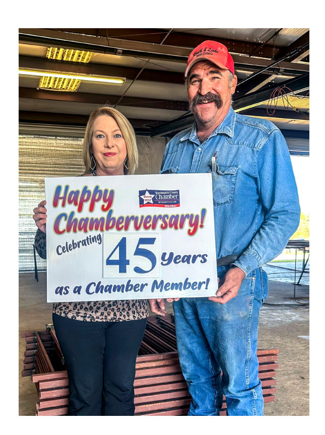
Korth & Linke Welding 45 years

The Blue Blazers have begun celebrating our member's "Chamberversaries" by surprising them with Celebration Visits and thanking them for their investment.