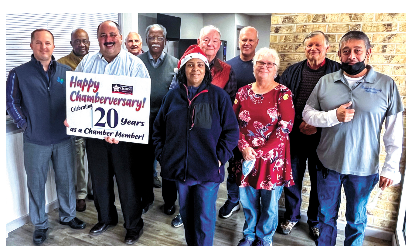
Brenham Housing Authority 20 years