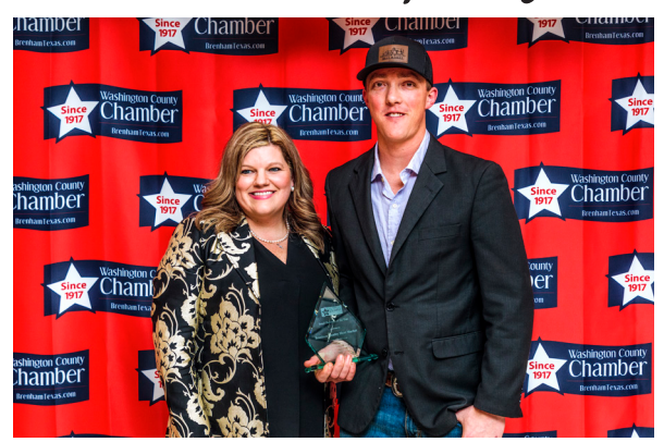
Brenham Quality Meat Market