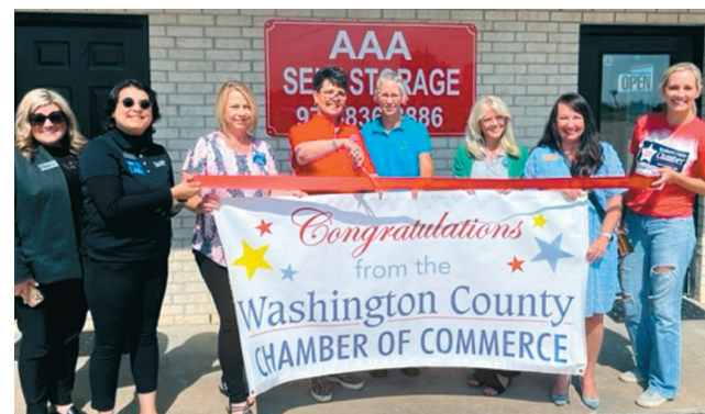
AAA Self Storage 4205 SH 36 N, Brenham