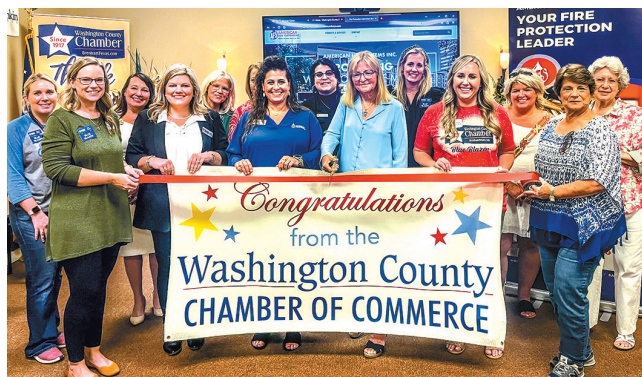
American Fire Systems, Inc. AmericanFireSys.com