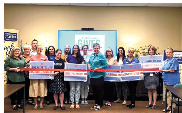
2023 Brazos Valley Gives Kick-Off - Washington County Non-Profits