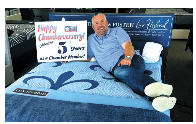
Mattrezzz Guys 5 Years