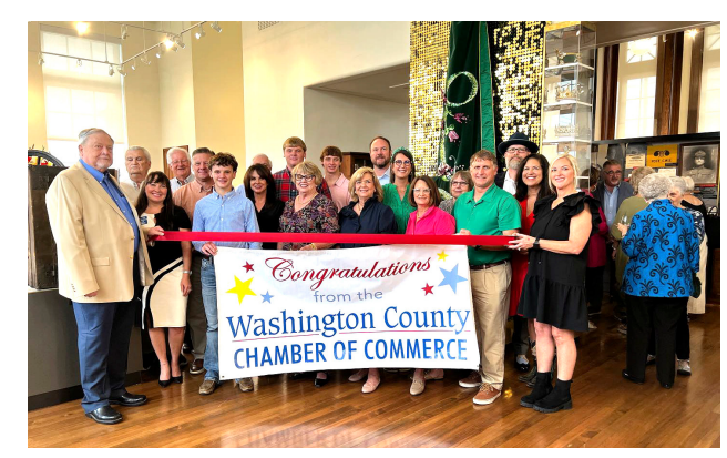
Maifest Exhibit – Brenham Heritage Museum 105 S. Market St., Brenham