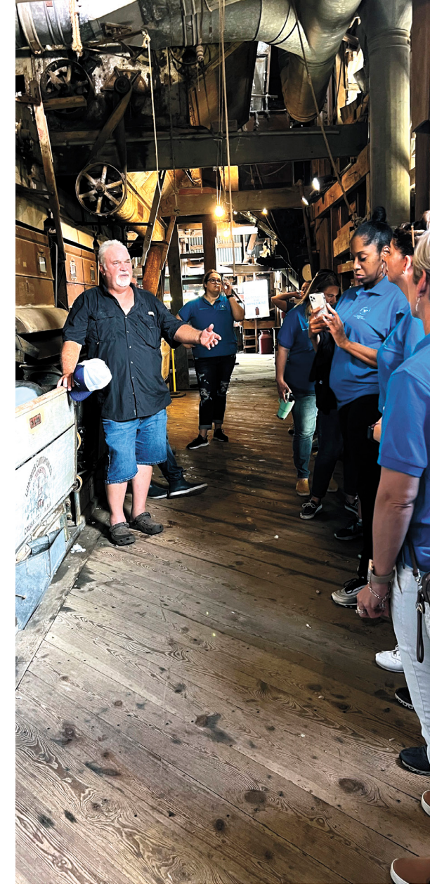
The class touring the Texas Cotton Gin Museum in Burton

Leadership Washington County is a program of the Washington County Chamber aimed at educating and motivating current and future leaders. Special thanks to the City of Brenham, The Barnhill Center, Texas Cotton Gin Museum, The Cannery Kitchen, and the Giddings-Stone Mansion for helping make this day possible.