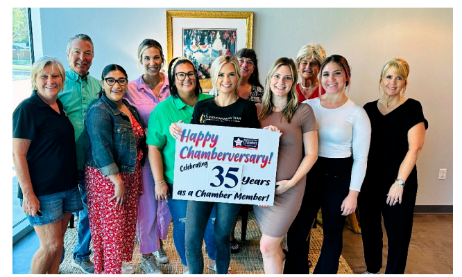
Coldwell Properties Unlimited & The Lindi/Camaron Team 35 Years