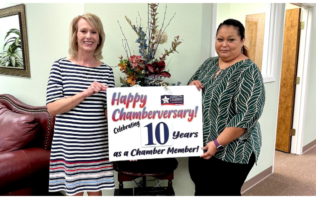
Washington County Insurance Agency 10 Years