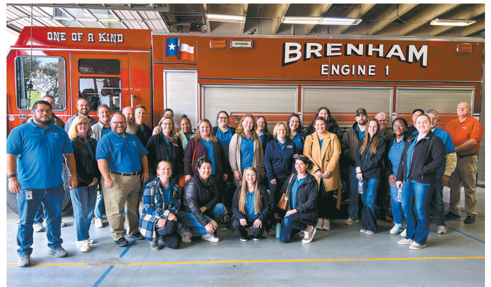
LWC Class of 2024 in front of City of Brenham Fire Truck.