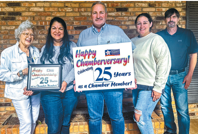
Hodde & Hodde Land Surveying, Inc 25 years