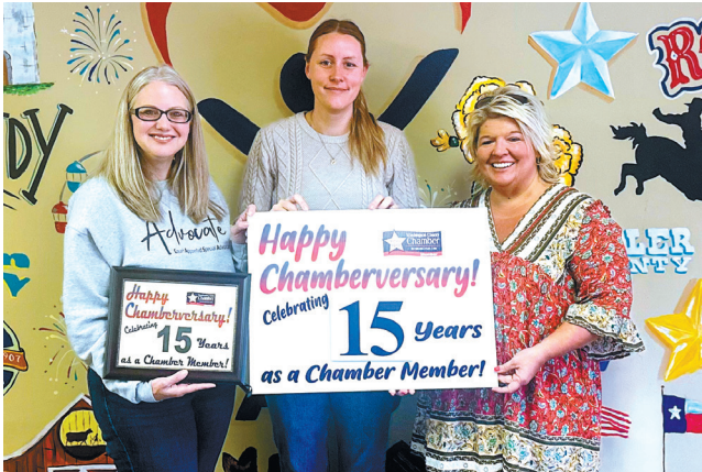
Casa for Kids of South Central Texas 15 years

The Blue Blazers have begun celebrating our member’s “Chamberversaries” by surprising them with Celebration Visits and thanking them for their investment.