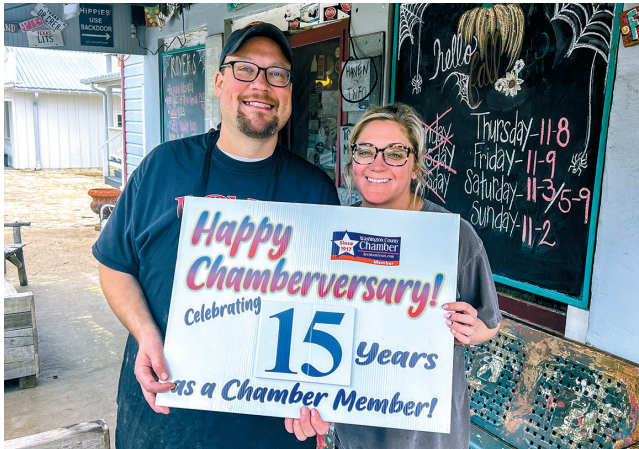
Royers Round Top Cafe 15 years

Walk-In’s Chamber of Commerce 257 Website – www.BrenhamTexas.com Unique Visitors 9,102 Total Pages 3,733