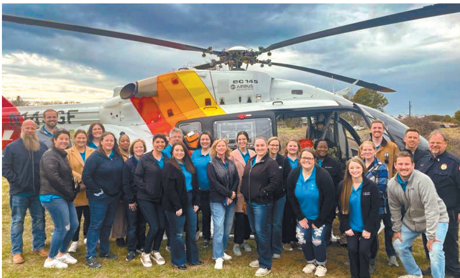
LWC Class of 2024 in front of the EMS helicopter.

The January session will be on healthcare. Leadership Washington County is one of the key programs of the Washington County Chamber designed to train and motivate leaders for this community. The next class will form in July 2024. For more details or to view the application form, visit the "Leadership" page on www.BrenhamTexas.com .