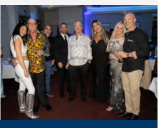
Monthly Dinner Meetings are held on the second Thursday of the month from 5:30pm to 8:00pm.