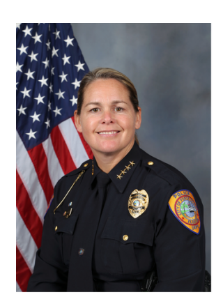
Pamela Davis Chief of Police Punta Gorda

The Punta Gorda Police Department is always receiving reports of scams and we do not expect that change anytime soon. There is little anyone can do to stop these scams from being attempted, but by continuing to discuss and educate people on these issues we hope we can minimize the number of people who fall victim to these awful crimes. Here are just a few of the most common types of scams that we see and ways to avoid them. Please read and share them with your neighbors.