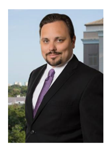
Derek P. Rooney Economic Development Partnership

The new resort is now an activity center in Charlotte Harbor, offering visitors a portal to some of the finest amenities on the gulf coast. These include: A state-of-the-art 7,100-square-foot fitness center and a full-service spa and salon as well as two pools including a 21,000-square-foot adults-only rooftop retreat and 117,000-square-foot ground-level experience (the largest pool in Southwest Florida). The convention area also includes innovative technology and features two waterfront ballrooms fully equipped with best-in-class A/V systems. Accompanying the two clear-span ballrooms are two executive boardrooms, 12 meeting rooms, and an ideation suite with three separate breakout rooms.