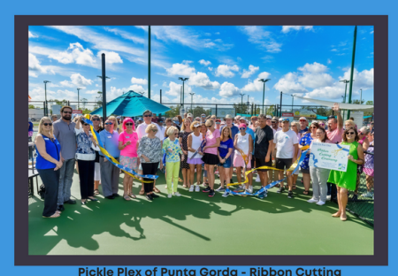
Charlotte County Chamber of Commerce October 6, 2023