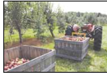
Rogers Family Orchards

Rogers Family Orchards 260 County Highway 131 Johnstown 518-762-8736