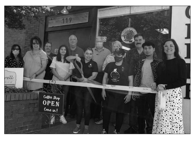
The Blue Cup