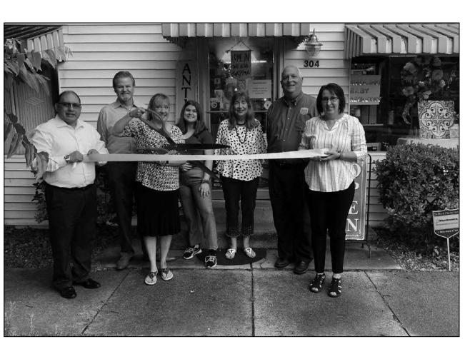
The Front Porch