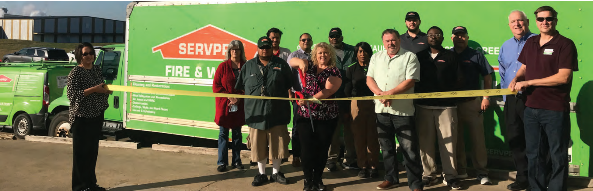
SERVPRO KAUFMAN COUNTY