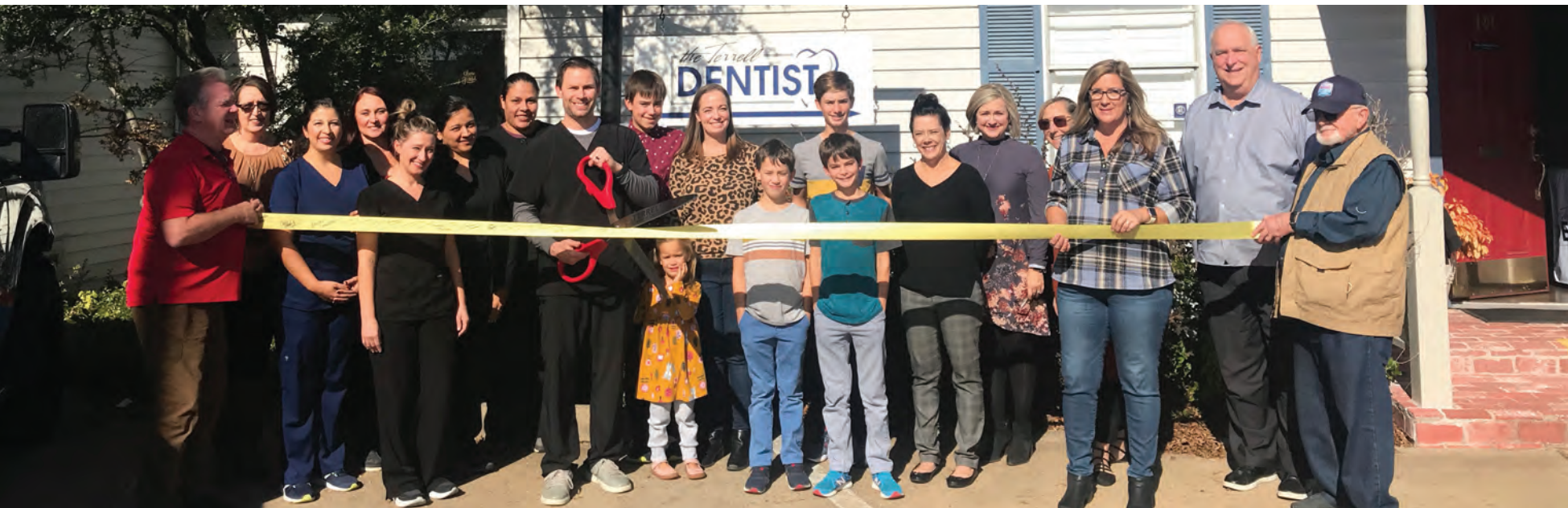
THE TERRELL DENTIST