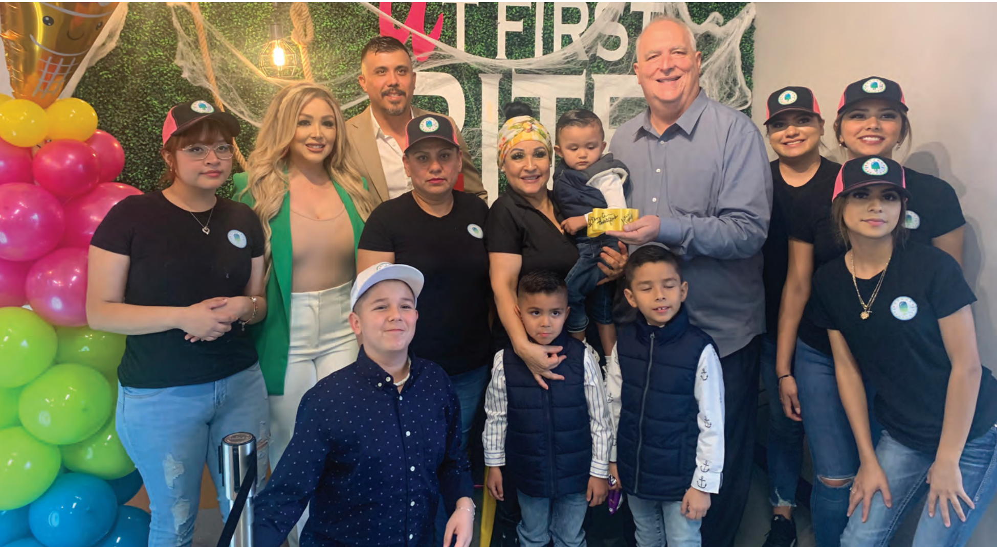
BOTANAS SNACK BAR