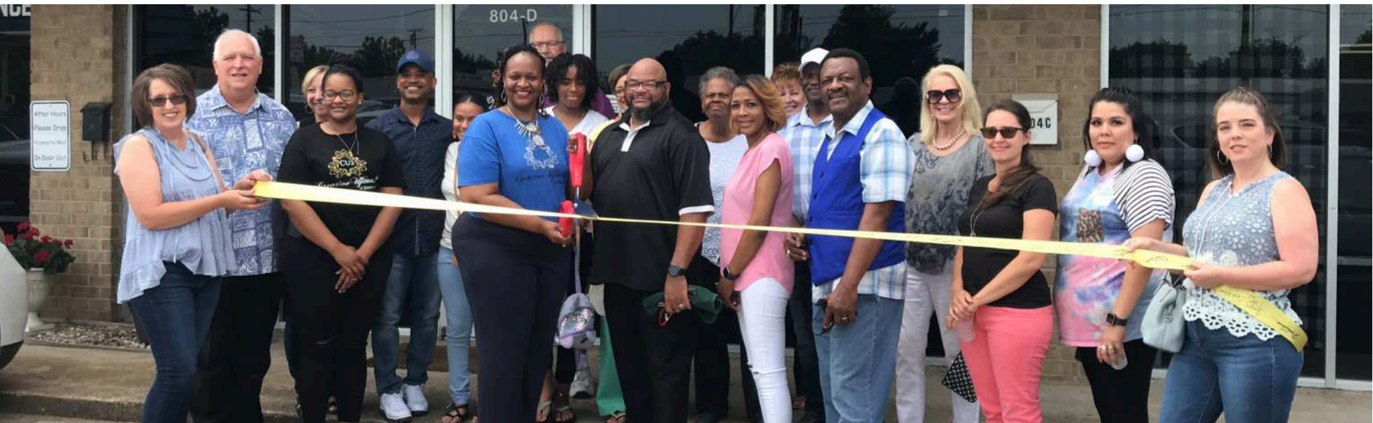
Creative Ujima 2