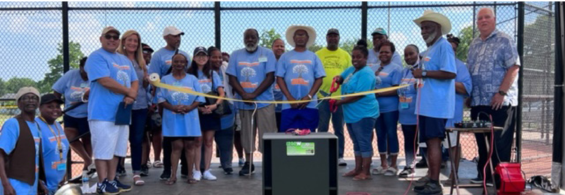
Association of Breezy Hill Park