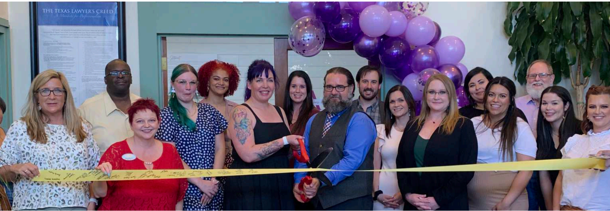
Ashmore & Ashmore Law Firm