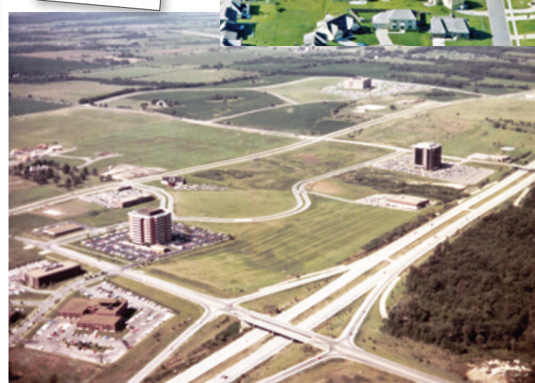
Above: Suburban Medical Center (now Overland Park Regional Medical Center) opened in 1978.