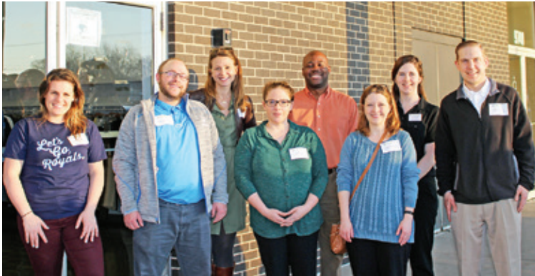
Several members of our Young Professionals group recently volunteered to help sort donations at the TurnStyles Thrift Store operated by Catholic Charities of Northeast Kansas .