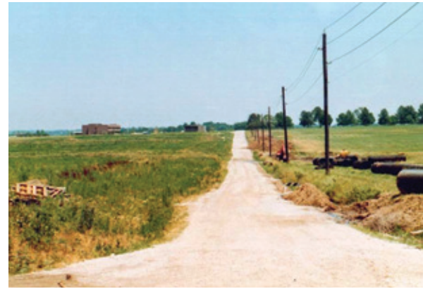
The country road that became College Boulevard, looking east from the area of Nall Avenue.

When business leaders established the Overland Park Chamber of Commerce in 1967, one of their priorities was to broaden the tax base by creating an environment where companies could thrive and create jobs, transforming Overland Park from a mostly residential bedroom community into a self-sustaining city offering not only a superior quality of life but also a plethora of employment opportunities.