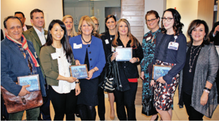
Some of our newest Chamber members received new member plaques at last month's Wednesday Wake-up event.