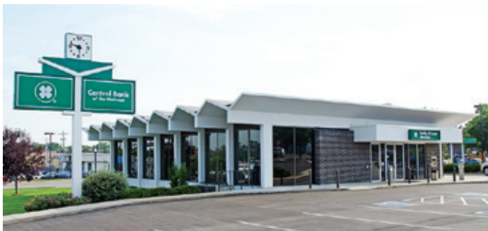
The original bank location at 79th Street and Metcalf Avenue.

For more information, visit www.centralbank.net .