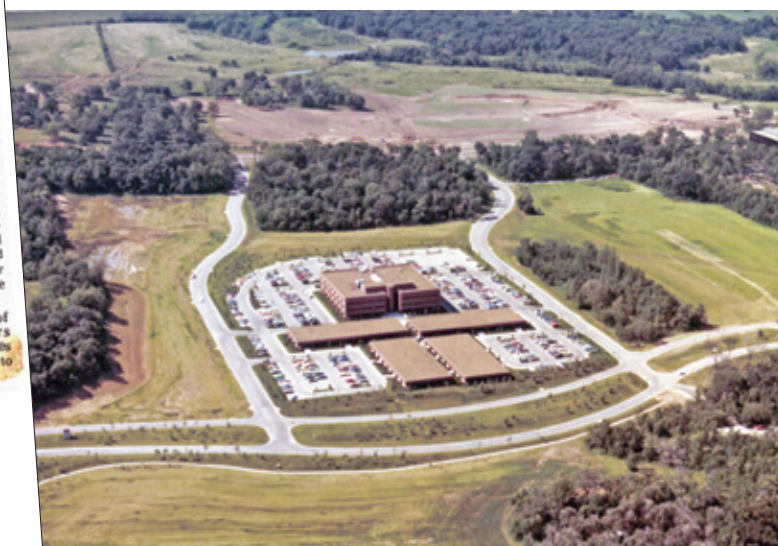
An early view of Buildings 20-24, the first buildings completed in Corporate Woods. Indian Creek Parkway runs along the lower portion of the photo.