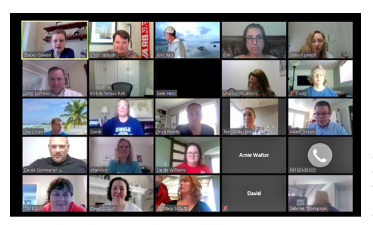
Teams like the Chamber's Diplomats group of business volunteers have been keeping their work going by meeting virtually.

My hope is that this temporary disruption to our normal routine will result in even deeper connections for our team as we move forward. In the meantime, keep those cameras on, and let's face this thing head-on!