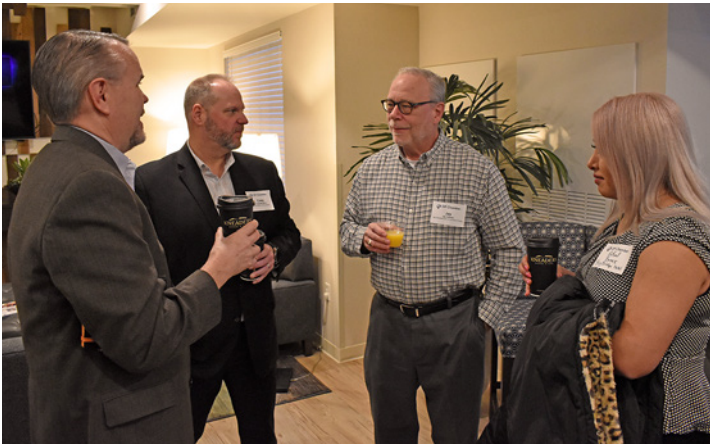
Members networking at the March Wednesday Wake-up event hosted by Oakwood WaterWalk.