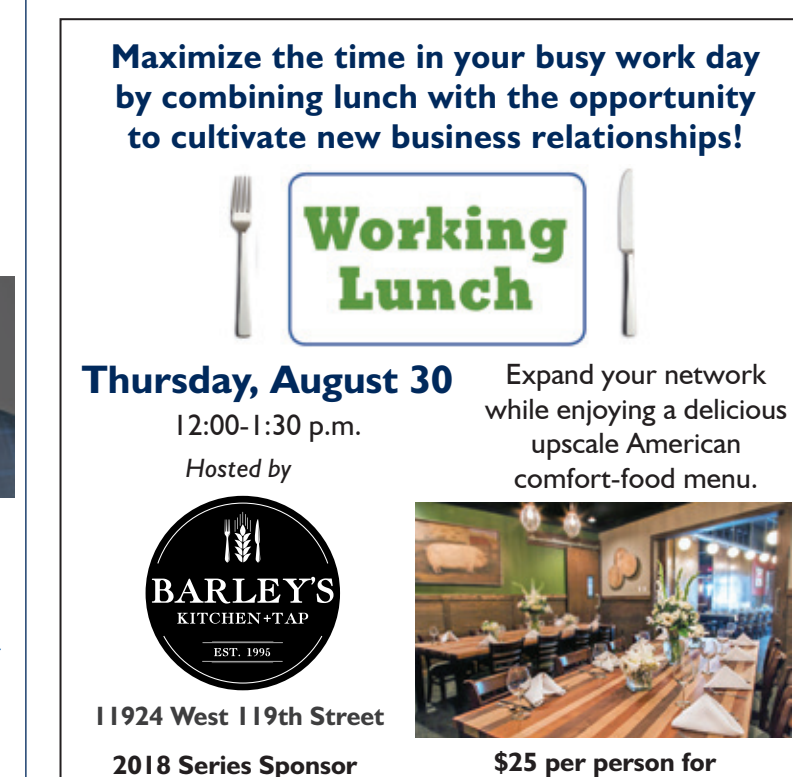
$25 per person for Chamber members only. To register, <u>click here</u>.

To register, click here or call (913) 491-3600