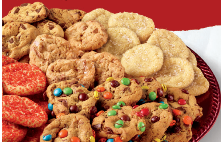
COOKIE BITE TRAY

Let Corner Bakery bring some joy to your seasonal party or get-together with our SAME DAY catering!