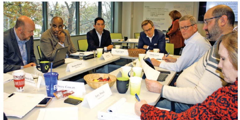
The Chamber Board of Directors recently held its annual board retreat to work on the Chamber's Plan of Action for 2018.

interest to the Chamber and our members. As always, we very much appreciate the fact that our elected representatives so generously share time with us on our trip and thank them for their work representing us in Congress.