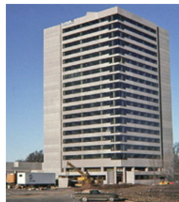
The DoubleTree Hotel came to Overland Park in 1982.

2008 – After years of resisting granting development subsidies, the City of Overland Park approved its first tax