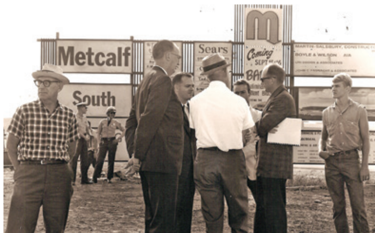
The opening of Metcalf South Shopping Center in 1967 helped make Overland Park the king of retail in the Kansas City area.