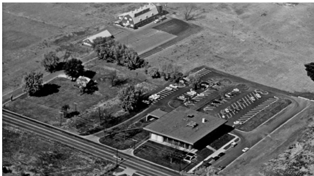
Valley View Bank opened at 95th and Foster streets in 1966.

Mize Houser & Company – Founded in 1956 in Topeka, Mize Houser & Company later added offices in Law-