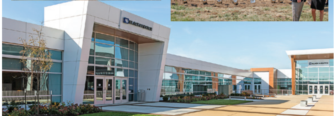
Overland Park Retail Sales November 2016