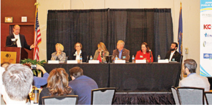
Members of the Johnson County Legislative Delegation have been participating in a Legislative Breakfast Series presented by the Johnson County Public Policy Council.