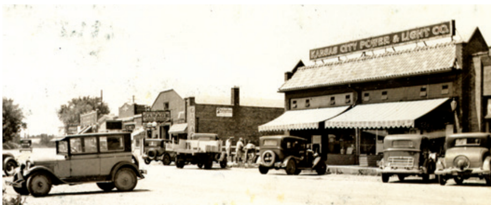
Beginning in the 1920s, Kansas City Power & Light had a large presence in downtown Overland Park.

Kansas City Power & Light – In 1924, Kansas City Power & Light moved its Kansas division to downtown Overland Park where it opened a retail office in the middle of the 7900 block of Santa Fe Drive. It began building power lines emanating from the Strang Line right-of-way, which served as the easement for one of the company's main high lines. KCP&L expanded its buildings and offices