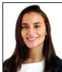
Britaney Wehrmeister Overland Park Convention Center