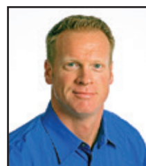
Kim Sword Turner Construction