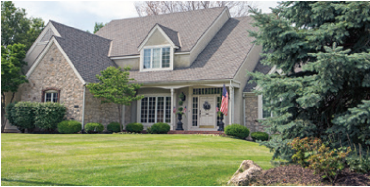
Johnson County appraised property values to increase

The data used to assess home values are available at www.jocogov.org/appraiser . Commercial property owners received appraised values in mid-February and have until March 14 to appeal.