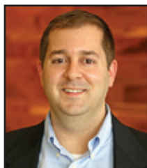
Hyleme George Black & Veatch