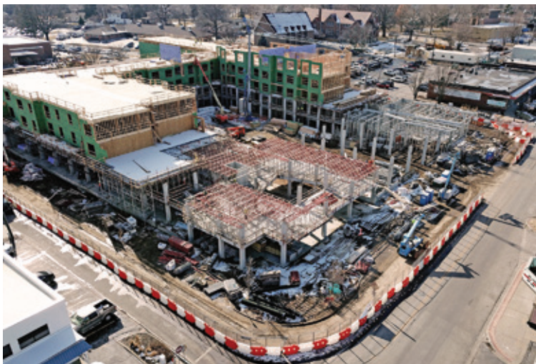
Hunt Midwest's The Vue development under construction in downtown Overland Park.