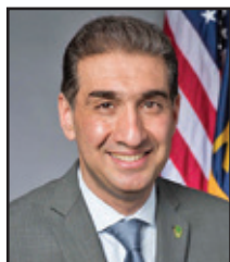
Faris Farassati City of Overland Park