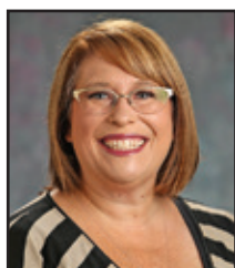
Joy Ginsburg Blue Valley Educational Foundation