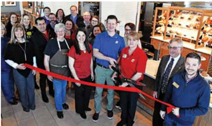
Panera Bread , 7871 West 159th Street For more information: (913) 336-1755 or www.panerabread.com .