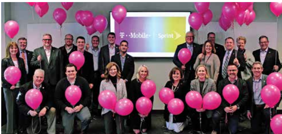
Chamber Board and staff celebrated the recent Federal District Court ruling on the Sprint and T-Mobile merger.