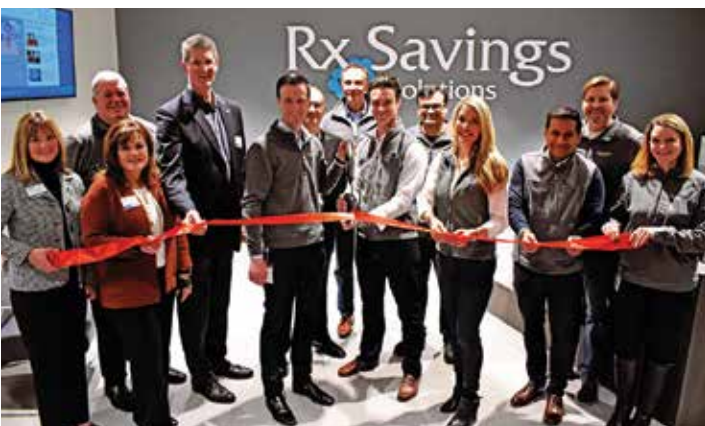
Rx Savings Solutions , 5440 West 110th Street, #200 For more information: (913) 815-3139 or www.rxsavingsolutions.com .