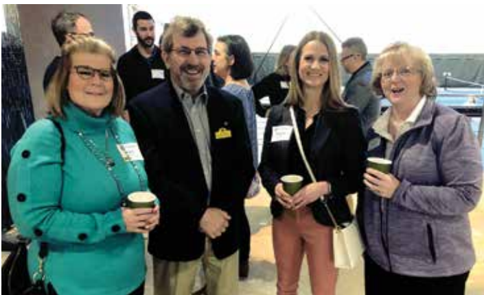
Members networking at the February Wednesday Wake-up event hosted by Genesis Health Clubs.