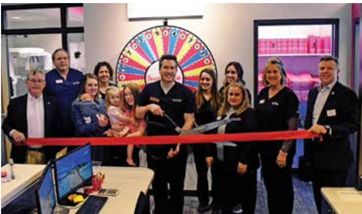
Sweet Tooth Pediatric Dentistry & Orthodontics , 7381 West 133rd Street, Suite 303 For more information: (913) 239-0703 or www.sweettoothpdo.com .