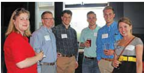
Our Young Professionals are gathering for a Happy Hour event this month.

For more information about the merger, click here .