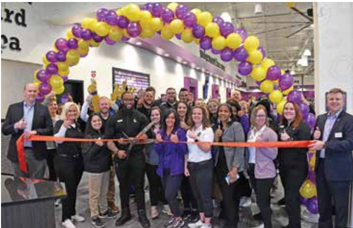
Planet Fitness , 11411 Metcalf Avenue For more information: (913) 788-6960 or www.planetfitness.com .