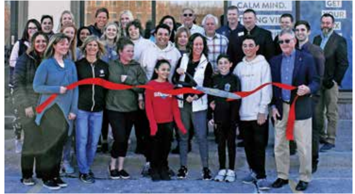
YogaSix , 6555 West 119th Street For more information: (913) 660-9320 or www.yogasix.com .