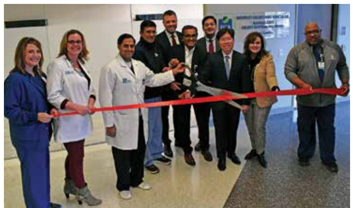
Cardiac electrophysiology lab at Overland Park Regional Medical Center , 10500 Quivira Road For more information: www.oprmc.com/heart .