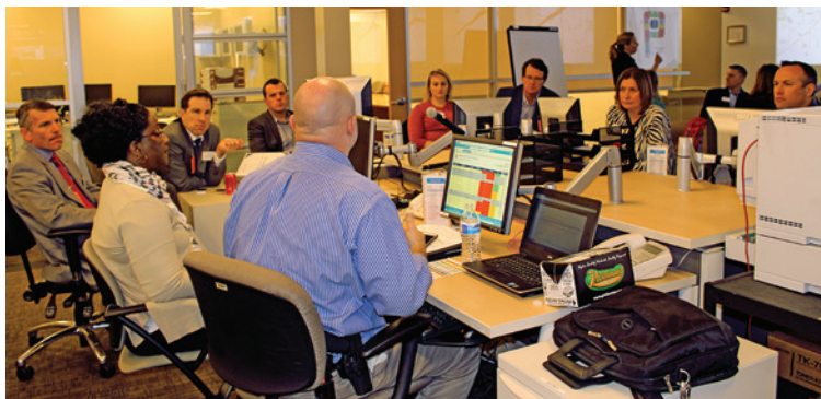
Class members participated in a mock scenario of how the city's command center team responds to emergency situations.