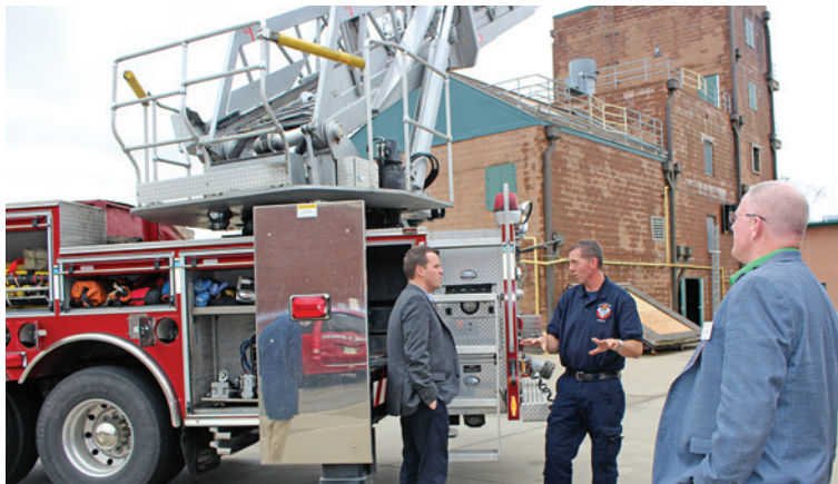
At the city's Emergency Operations Center, class members learned about equipment used by public safety officials.