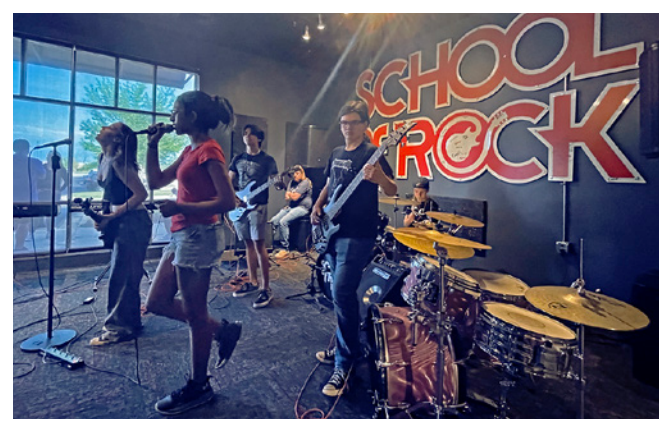
Chamber members enjoyed networking and a performance by students of <u>School of Rock Blue Valley</u> at June's Wednesday Wake-up event.