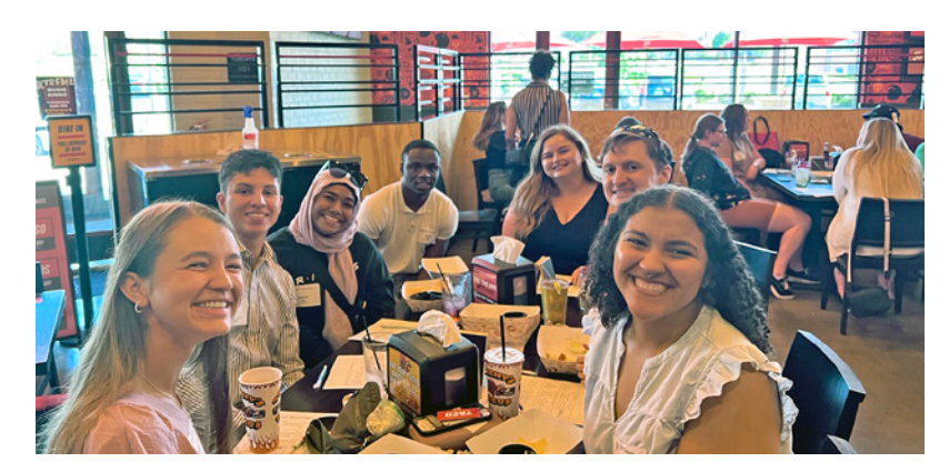
Overland Park Young Professionals enjoyed a Mix & Mingle networking event hosted by <u>Torchy's Tacos</u>, 6815 West 135th Street

Built partners with Overland Park lighting manufacturer Mercer Zimmerman. For more info: (913) 568-7090 or <u>click here</u>.