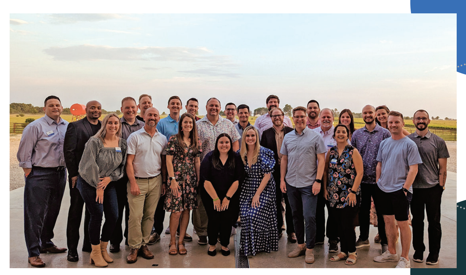
2023 Leadership Overland Park class members posed during their class project fundraiser to benefit improvements at Deanna Rose Children's Farmstead for vision-impaired visitors. For details, see page 7.

For more information about the sales tax, click here.