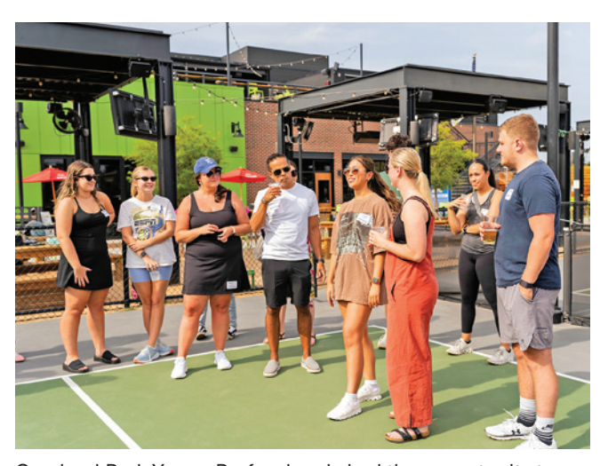
Overland Park Young Professionals had the opportunity to socialize with their counterparts from the Lee's Summit Chamber of Commerce at a networking event at <a href="Chicken N">Chicken N</a> <a href="Pickle Overland Park">Pickle Overland Park</a>.