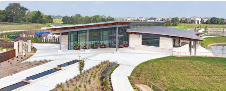
LongHouse Visitor Center at the Overland Park Arboretum and Botanical Gardens.

The company recently completed the new visitors center at the Overland Park Arboretum. Inspired by nature, the new LongHouse Visitors Center functions as a multipurpose building by hosting community meetings and large social events such as weddings, receptions and exhibits. Additional amenities include a community room, gift shop, café Celeste, outdoor patio and the waterside terrace.