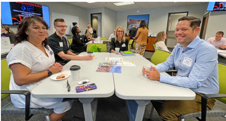
Some of our newest members had the chance to connect and learn more about the Chamber at our recent Member Orientation sponsored by Lettiann & Associates Real Estate Services .