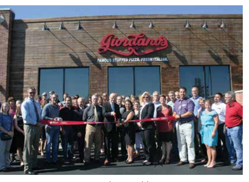
Giordano's Ribbon Cutting