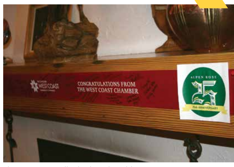
Alpen Rose proudly displays the Ribbon Cutting memento