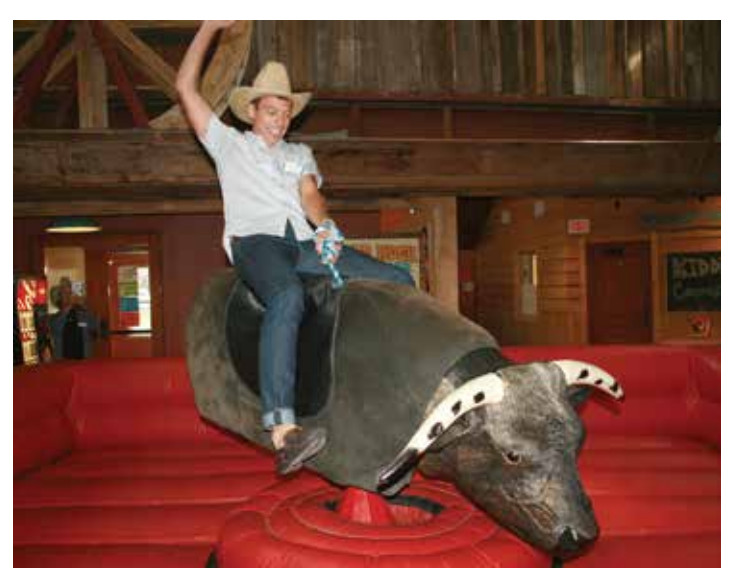
West Coast Leadership Retreat