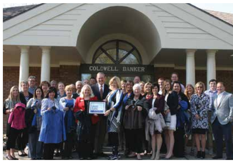
IMPACT Awards- Coldwell Banker