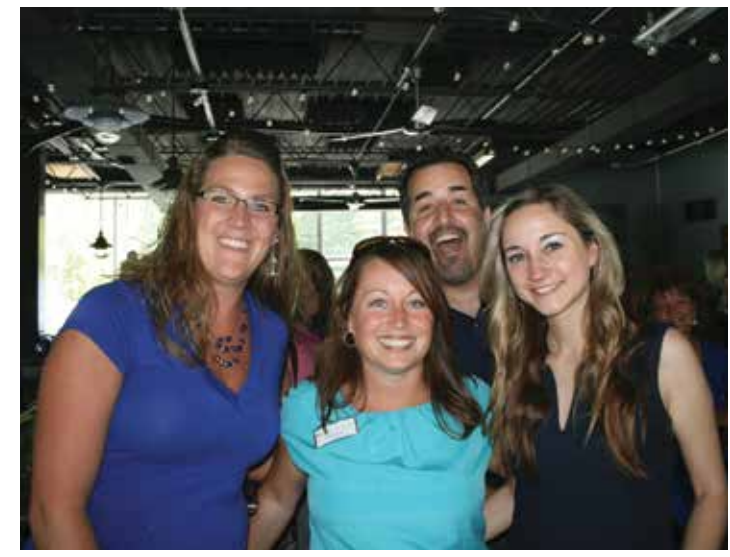
Ambassador end of the year party