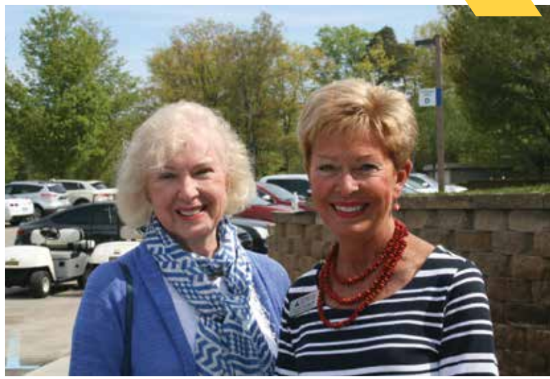
Camp Geneva Ribbon Cutting