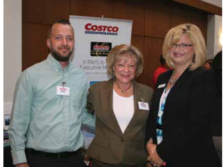
May 2016 Early Bird Breakfast