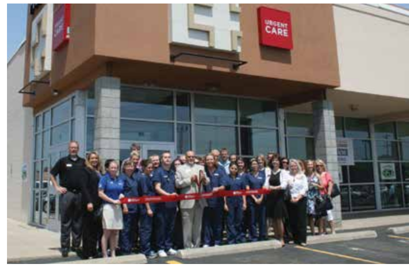
MedExpress Ribbon Cutting