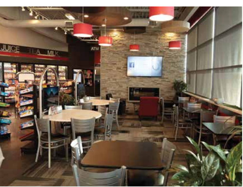
Quality Car Wash & Tim Horton's on Chicago Drive in Holland

Hollanders have come to equate the signature red 'Q' of Quality Car Wash locations with friendly smiles, quality results and fast service.