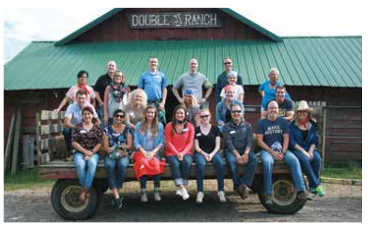
West Coast Leadership class retreat at Double JJ Resort.