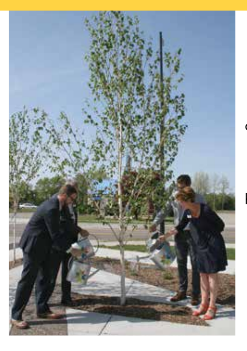
Marking the day with a ceremonial tree watering, to thank our donors for helping us grow.