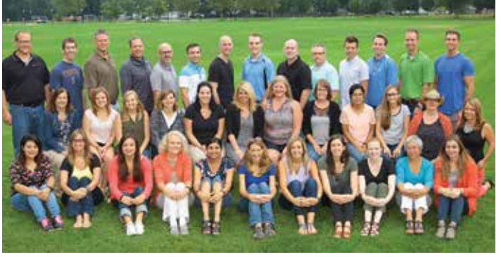
West Coast Leadership class.