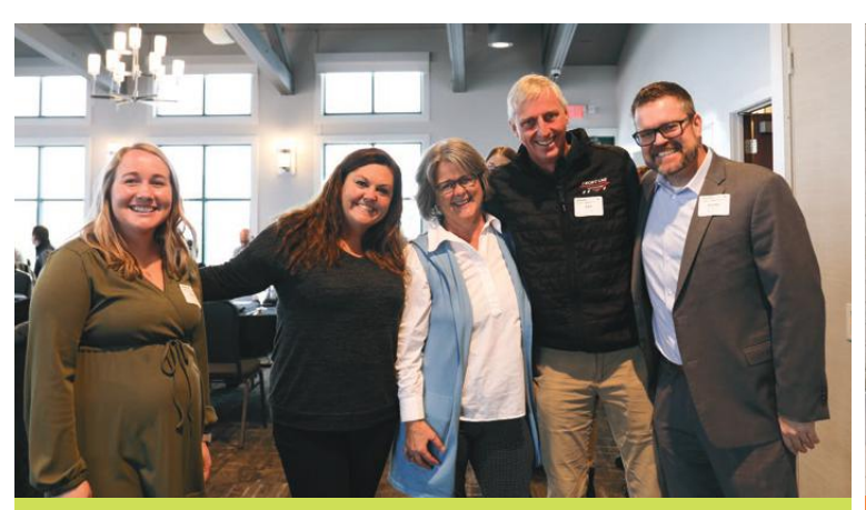
Engaged Chamber members pose for a photo at the November Power Lunch event.