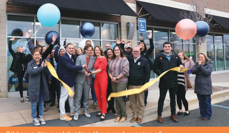
Ribbon cutting celebrating the grand opening of Prime IV Hydration & Wellness in Holland.