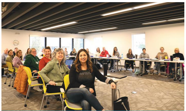
Our friends at the Career Line Tech Center utilized our Learning Lab