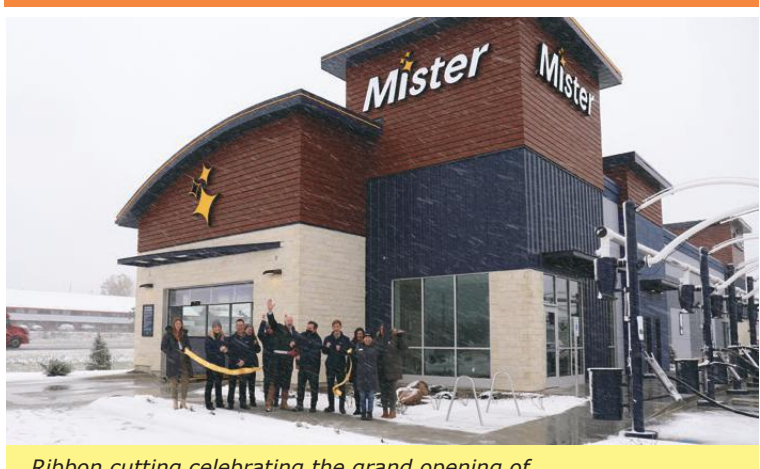
Ribbon cutting celebrating the grand opening of Mister Car Wash's brand-new location in Holland.