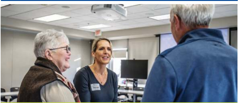
Engaged community members network at our Zeeland Affinity Group meeting.