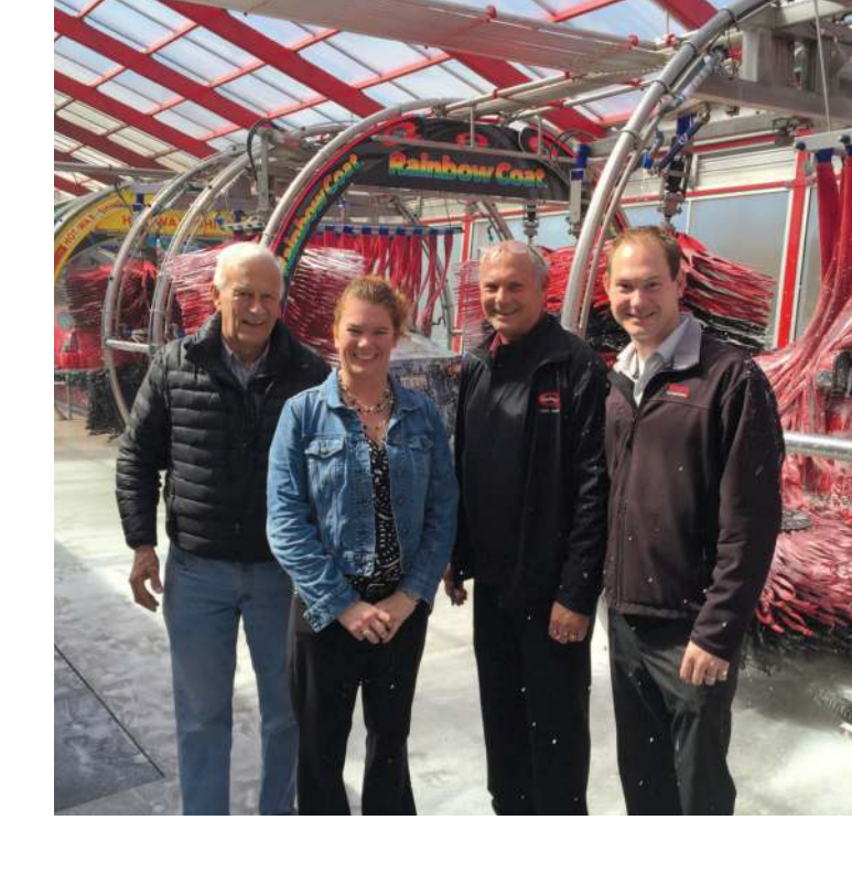
plate-based club memberships. We're working on even more significant innovations with the development of our new flagship "Northtown" location on River Avenue, which will feature an assembly line-like interior cleaning process where we'll be developing cutting-edge automated interior cleaning technology.

Likewise, the most significant innovations in car washing have also been founded here, like the belt conveyor technology, modular car wash buildings, and license