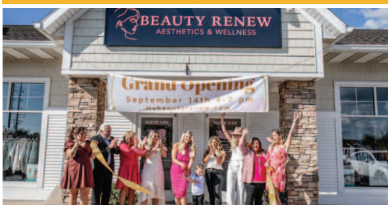
Beauty ReNew Aesthetics & Wellness celebrated the grand opening of their new space located at 11539 E Lakewood Blvd, Suite 110, on the Northside of Holland with a ribbon cutting.