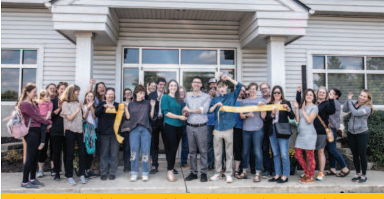
Avalon School of the Arts celebrated the grand opening of their new space located at 144 Coolidge Ave on the Southside of Holland with a ribbon cutting.