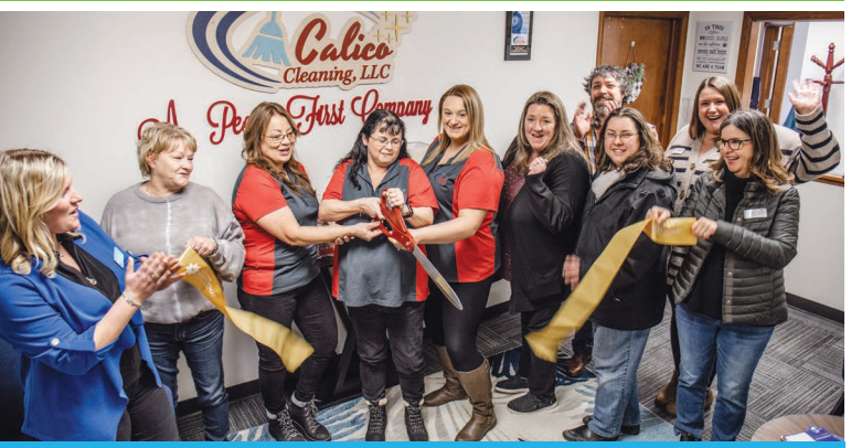
Calico Cleaning officially celebrated the opening of their new Holland Location with a ribbon cutting celebration – join us in congratulating them on this awesome achievement!