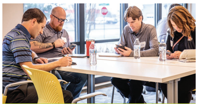
The Chamber launched its first ever Conversational Spanish Series in partnership with Estrellas Language Academy. Over 30 Chamber members participated in the first session.