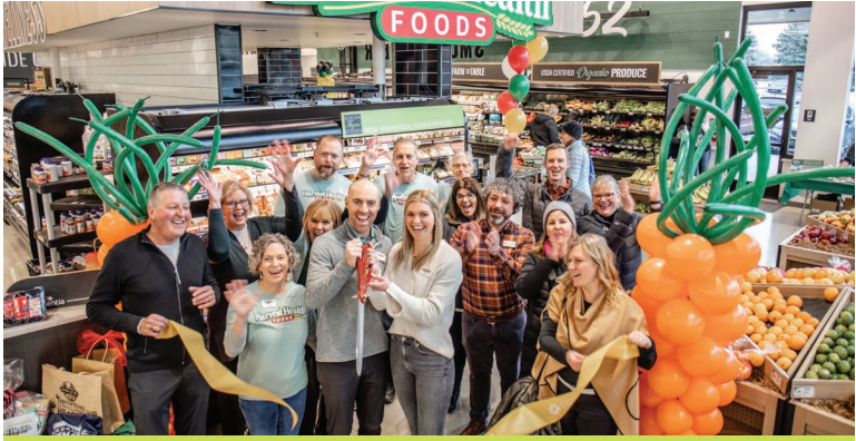
From Ground Breaking to Grand Opening Celebration, the Chamber team is thrilled to have celebrated Harvest Health Foods new location in Holland!