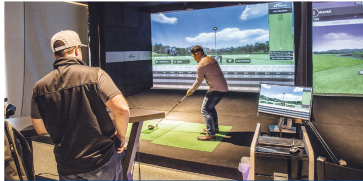
Holland/Zeeland Young Professionals teamed up with the Chamber to host a Social Hour at X-Golf Holland where members were treated to lessons on the golf simulators, a catered dinner, and fun giveaways. Thank you, X-Golf Holland!