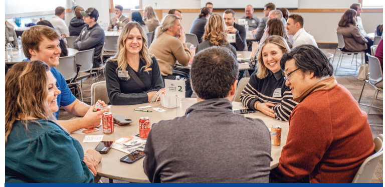
Feeling the Zeel? We sure were at our Power Lunch at the Zeeland Howard Miller Community Center. Over 60 Chamber members attended our structured networking program, sponsored by Gordeaux Consulting, and catered by Vitale's Pizza.