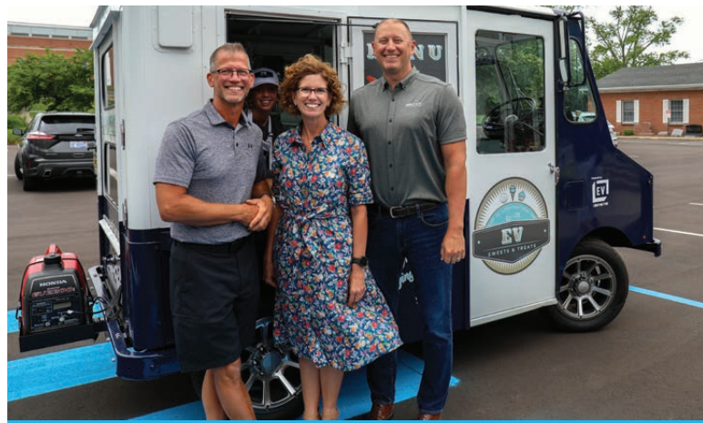
West Coast Chamber Board Members celebrating outgoing members with a sweet treat from EV Construction's Ice Cream Truck!