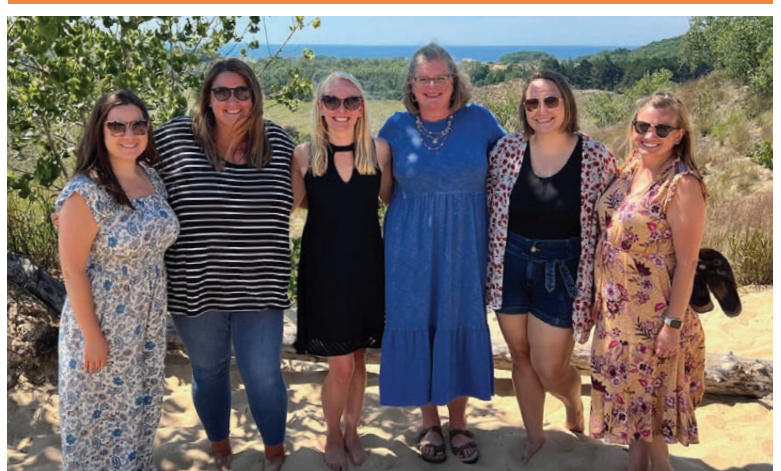
Chamber Staff enjoying a break on the Saugatuck Dune Rides.