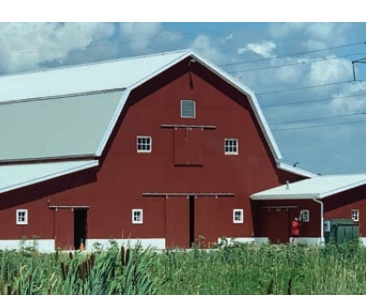
One of our new barns.

www.universaldesign.ie/what-is-universal-design