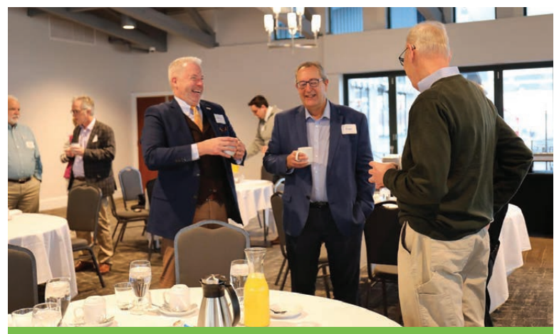
Chamber Members enjoying pre-program networking and coffee at March Advocacy in Action.