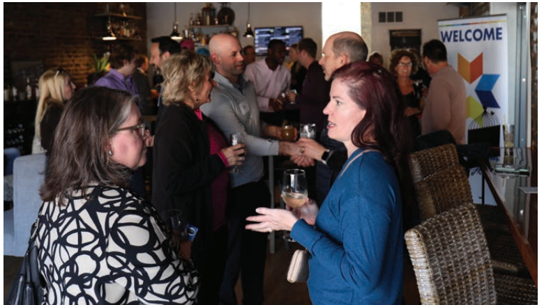
Chamber Members are "Out-Of-Office" attending Happy Hour at Brew Merchant.