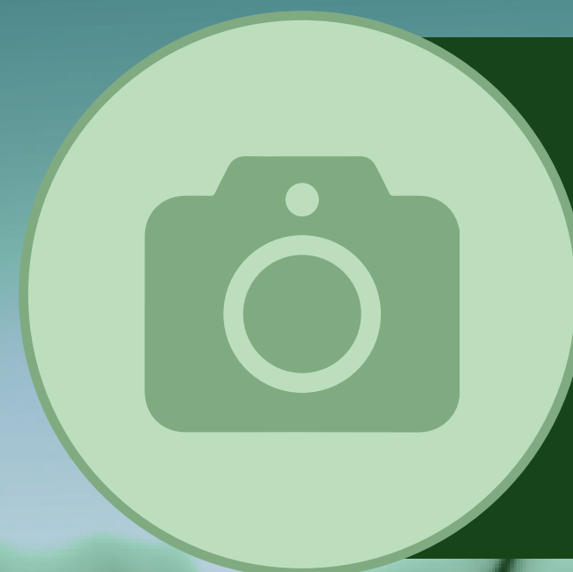
PHOTO BOOTH SPONSOR