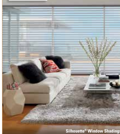
Silhouette® Window Shadings

Get ready for holiday gatherings with stylish new shades and save.