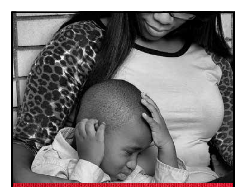
Give a Christmas blessing to those who are homeless for the holidays.

to change at any time. The effective date for the 1.75% APY is April 9, 2018 Fees may reduce earnings on the account. To avoid a monthly paper FDIC statement fee, enroll in our electronic eStatements.