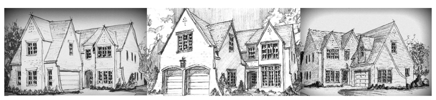
Fairhaven Drive & Poe Drive at Overton Village