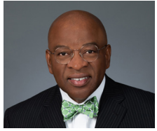
James E. Robinson Spire