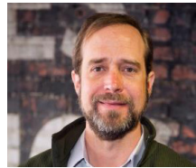
Stephen Allen Williams Blackstock Architects, PC