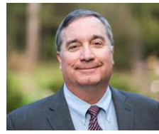
Senator Dan Roberts