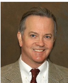
Robin Morgan 2002