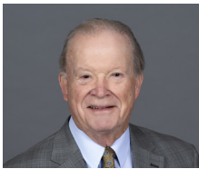
Senator Jabo Waggoner