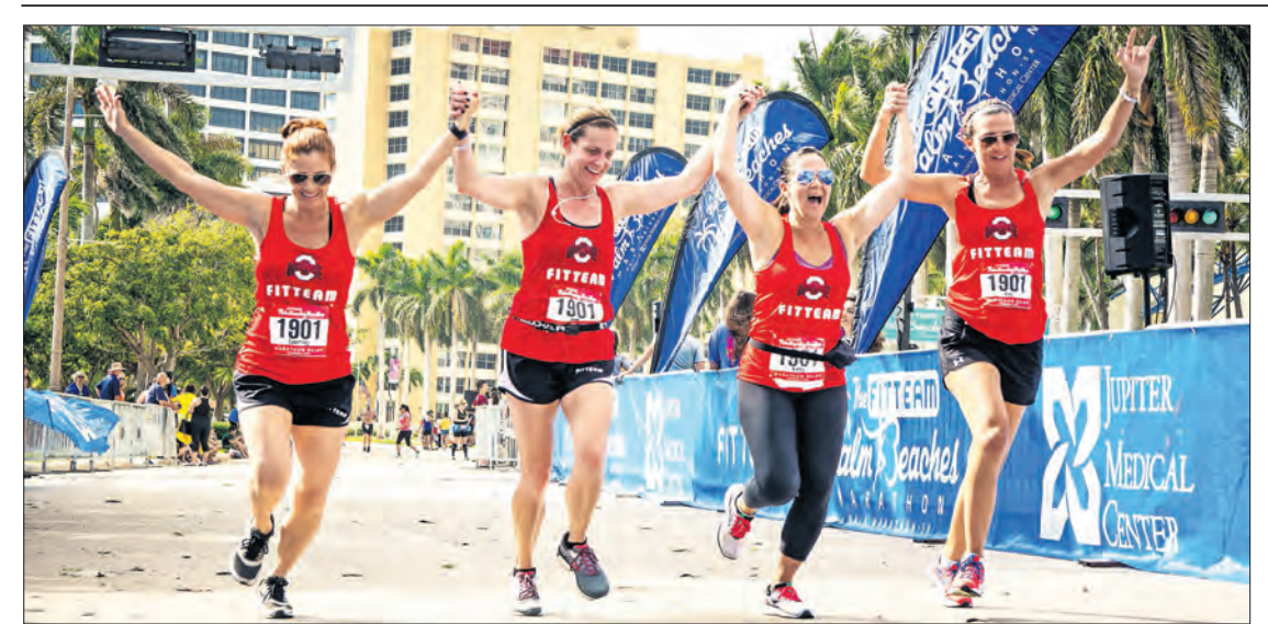
A relay team from this past weekend's FITTEAM Palm Beaches Marathon.