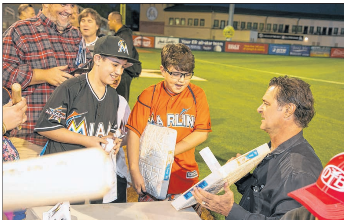
Don Mattingly, Miami Marlins Manager, autographs a base for kids at the Baseball Bash.