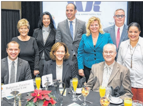
Staff of Bahamas Paradise Cruise Line