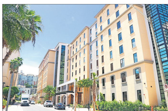
Watson Family Hall

At the corner of Pembroke Place and South Dixie Highway, Watson Hall places residential students near their classes, faculty offices and campus life. Each of the one- and two-bedroom units has a full kitchen and increased safety and security features based on a