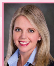
Melissa McKinlay Palm Beach County Commissioner, Palm Beach County Board of County Commissioners