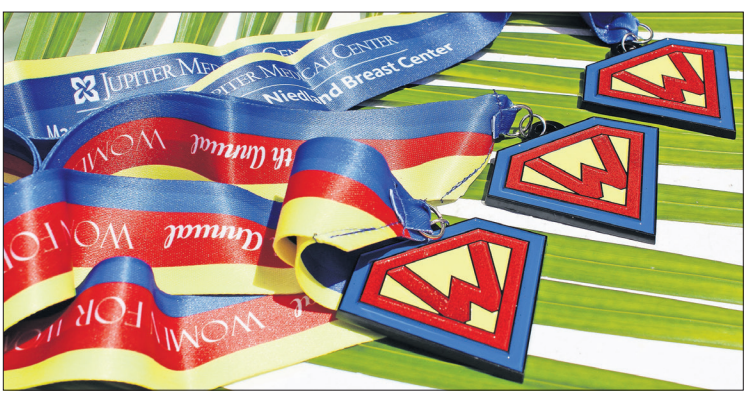
Runners will receive a custom finisher's medal.

Generations of women, ages 7-80-plus, will run and walk together to empower their competitive spirit at this special event, appropriately scheduled for Mother's Day weekend. Each runner will receive a custom finisher's medal and race tech shirt. Again this year are categories