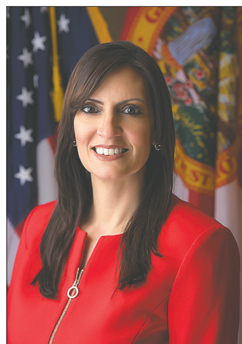
Florida's Lieutenant Governor Jeanette Nunez