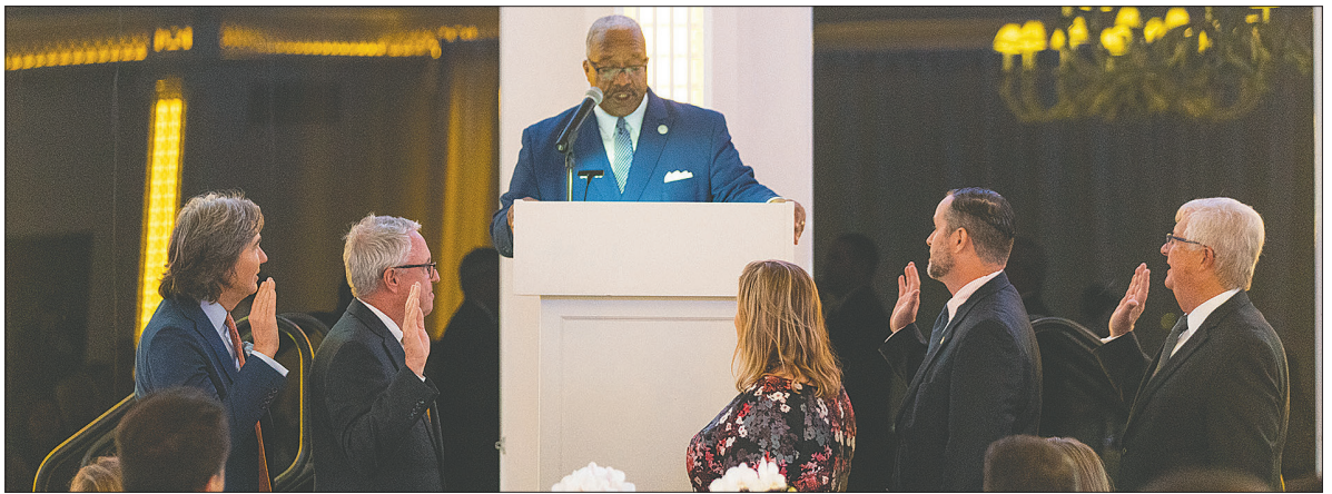
City of West Palm Beach Mayor Keith James swears in the incoming officers.

The installation of officers for 2022 took place on Saturday, Oct. 16 at The Beach Club in Palm Beach.