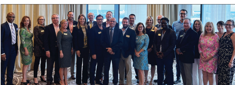
Oct. 17 Trustee Luncheon