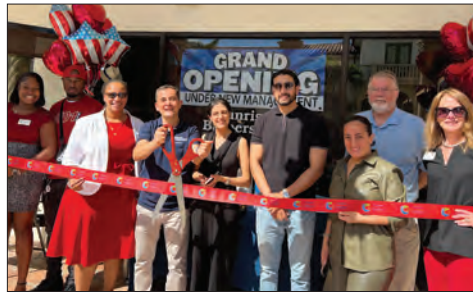
Sunrise Barbershop Feb. 14, 2024

239 Sunrise Ave., West Palm Beach, FL 33480 561-659-0464; baghrmryan77@gmail.com