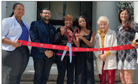
Starz Financial & Insurance Services Feb. 15, 2024

239 Sunrise Ave., West Palm Beach, FL 33480 561-659-0464; baghrmryan77@gmail.com