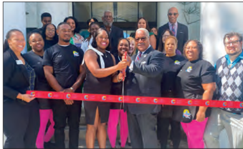
Mo Knows Cleaning LLC Feb. 20, 2024

505 S. Flagler Dr., Suite 1100 West Palm Beach, FL 33401 561-659-3000; info@jonesfoster.com jonesfoster.com