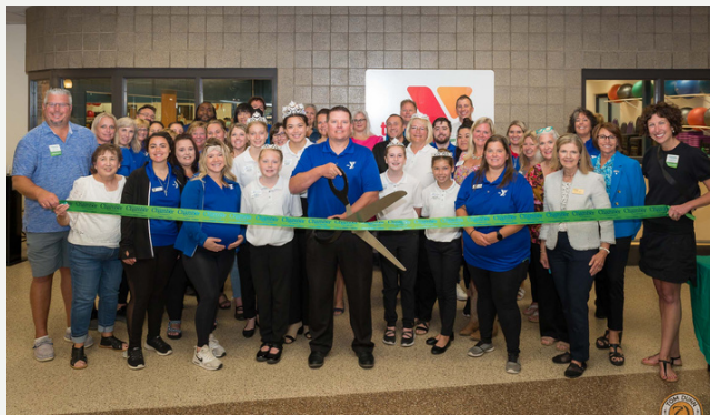
YMCA 25th Anniversary 2175 Radio Drive