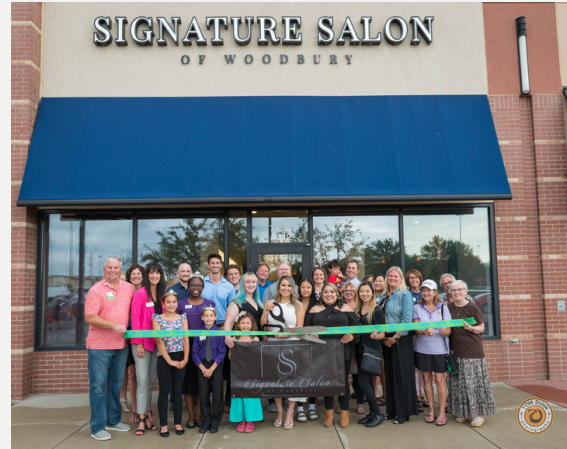
Signature Salon of Woodbury 7150 Valley Creek Plaza, Suite 21