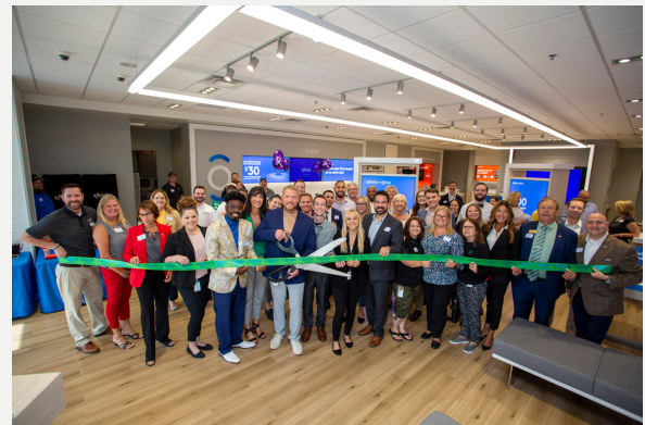
Xfinity by Comcast Store Remodel 429 Commerce Drive