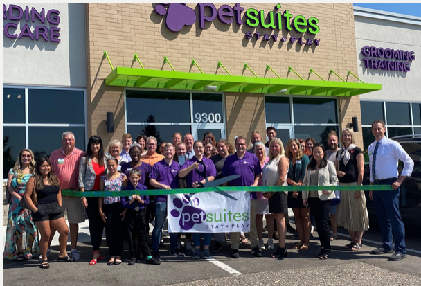
PetSuites Woodbury 9300 Hudson Road