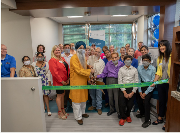
Minnesota Vein Center 731 Bielenberg Drive, Suite 208

The Chamber provides ribbon cuttings for new businesses in the community who join the chamber as well as for members celebrating a 10+ year milestone business anniversary, moved to a new business location or completed major renovation.