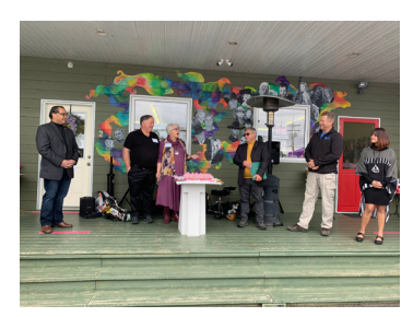
Gossamer Gallery& Gifts 5th Anniversary