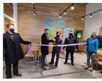
Stony Plain A&W Grand Opening