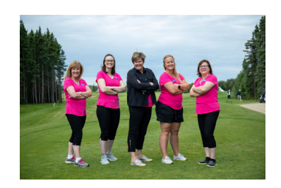
Chamber Staff at the Golf Tournament

Once it is safe to do so, and restrictions allow, we look forward to welcoming you all back to inperson events, and seeing the faces that we have missed so much.