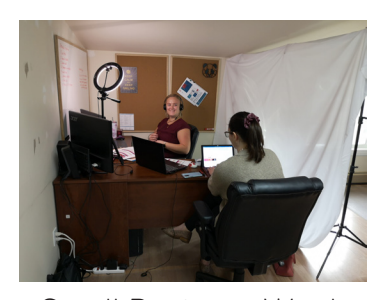
Small Business Week