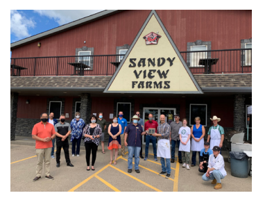
Sandyview Farms 35th Anniversary