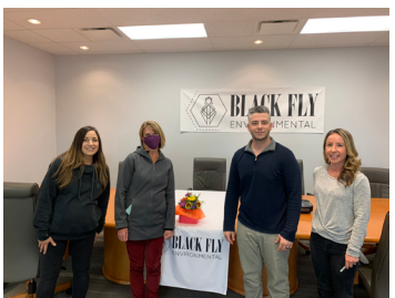
Delivering Flowers to ABAD Nominees